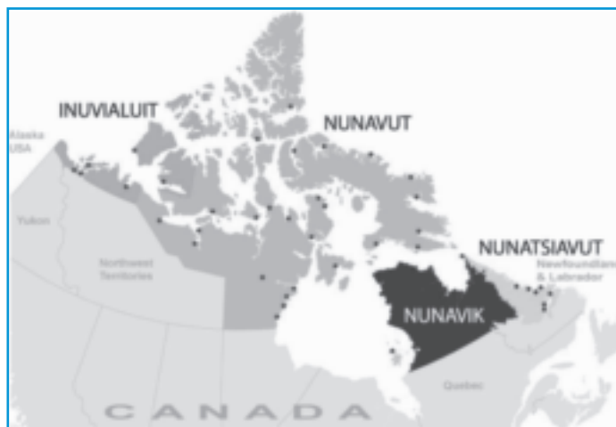
FIGURE 1: INUIT REGIONS OF CANADA WITH LOCATIONS OF INUIT COMMUNITIES 7

link between communities and a hunting platform for over seven months of the year in most areas.