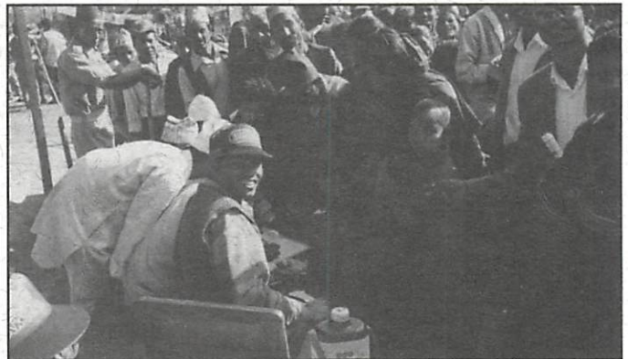
Local officials at the Negalpanini polling station in Dhading province, Nepal review the registration qualifications of voters. Nonetheless, some individuals below the legal voting age were permitted to vote.