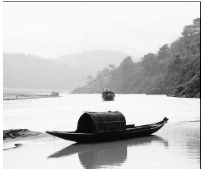
Yangtze River, Sichuan province, China

In the process of carrying out projects they claim advance development goals, policy makers regularly ignore the needs of the most marginalized in society . . . often worsening their situation.