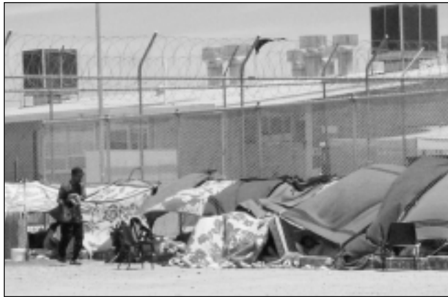
Hunger strikers sheltering under bedding around the internal perimeter fence of the Main Compound.

after a standoff lasting several days, relocated the refugees to New Zealand, Papua New Guinea (PNG), and the Pacific island nation of Nauru. In October 2001, another Australian patrol ship picked up 216 refugees, mainly Iraqis, from Ashmore Reef, an Australian island, and deposited them on Manus, an island belonging to PNG. These two incidents represent the “Pacific Solution,” an initiative of the recently re-elected conservative government of Prime Minister John Howard, whereby refugees, including those who are asylum seekers, are either removed from Australian territory or prevented from reaching Australia. In return for agreeing to take the refugees for processing, Australia has committed to paying PNG and Nauru millions of Australian dollars. Since the Tampa incident, Australia has relocated more than 1,500 refugees in this manner.