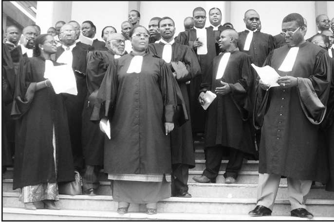
Togolese lawyers take to the steps of the court to protest the seizure of power by Faure Gnassingbe (February 2005).

elections.” This responsibility does not lie in the mere monitoring of the election process. It involves facilitating an even political playing field. Unless these measures are put in place, the mere presence of an ECOWAS election monitoring force will not make much difference.