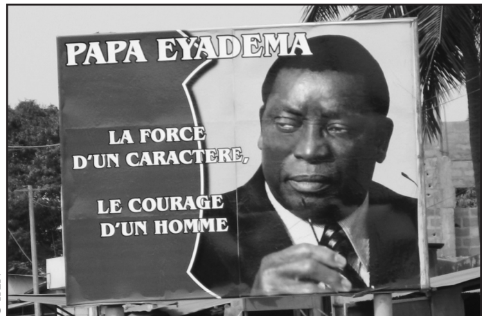
Billboard in the Togolese capital, Lomé, of Gnassingbe Eyadema, the man who ruled over this West African nation for 38 years (February 2005).

Nigeria's President Olusegun Obasanjo, the current chairman of the AU, said the appointment was unconstitutional and refused to accept the transition of power. AU Commission Chairperson Alpha Omar Konare labelled the succession a military coup d'état. He called for the constitutional order to be re-established and for the President of the National Assembly to assume power properly. Both the Executive Secretary of ECOWAS, Dr. Mohamed Ibn Chambas, and ECOWAS Chair, President Mamadou Tandja of Niger, were unequivocal in expressing ECOWAS's opposition to the coup plot.