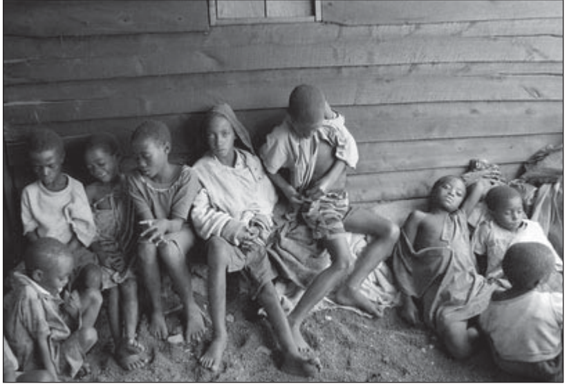
Children who fled the fighting in Rwanda rest in Ndosha camp in Goma.

actions is not a positive indication of international consensus that individuals cannot participate in such actions. Indeed, private actors have important attributes such as fewer political constraints, flexibility and agility in making decisions, and the ability to deny having national interests. Moreover, where states fail to take sufficient actions — as with the Rwanda RTLM case — private actors may be a victim's only remaining source of protection.