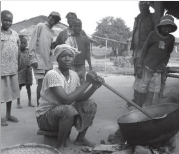
Many children were dragged into the bush and forced to serve as soldiers. Some were made to murder their parents.

facilities, descended upon West Africa to begin a decade-long campaign to conquer the region politically, by force if necessary. Charles Taylor, who had escaped from prison in the United States, slipped quietly into Liberia and began a long civil war. Taylor looked west over the border with Sierra Leone to that country's alluvial diamond fields and partnered with Foday Sankoh, another graduate of the Libyan training camps and corporal in the Sierra Leonean Army. Diamonds would help keep Taylor's revolution and bank account well financed. 8