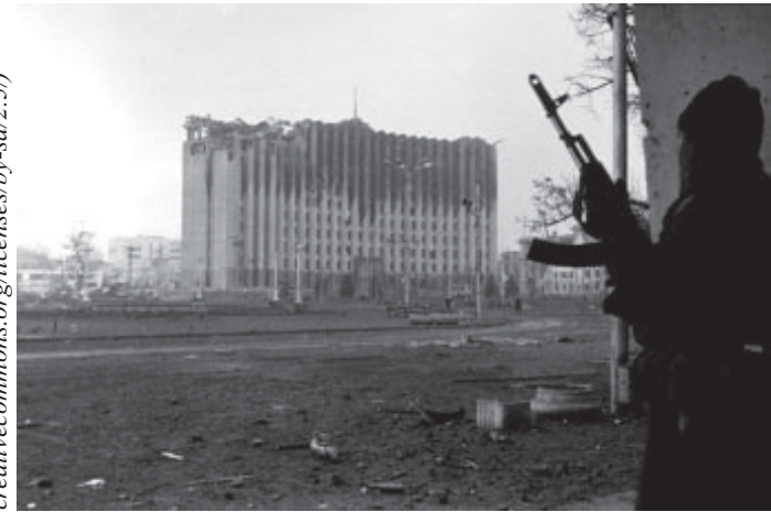
The Russian government has blocked European Court requests for documents sought in connection with Chechens' claims.

federal forces were responsible for the violations, and there were no direct eyewitnesses to the killings.