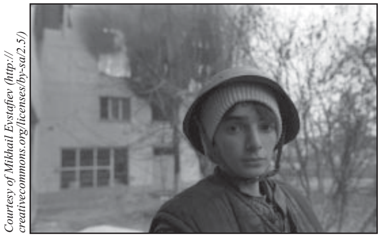
The second Chechen War was characterized by widespread human rights abuses against the civilian population.

While human rights violations were also widespread during the first Chechen war, Russia's 1998 ratification of the European Convention on Human Rights (the Convention) provided victims of the second war with a powerful new tool for seeking redress for human rights violations — the ECtHR. As a result of Russia's ratification, the ECtHR obtained jurisdiction to review violations of the Convention in Russia, including Chechnya, that have taken place since May 1998.