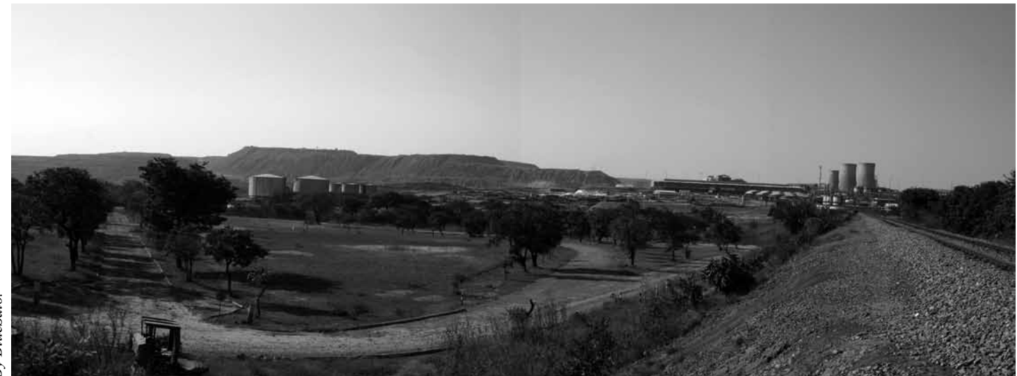
A copper mine near Chingola, Zambia.

The Zambian government views NFC's mining investment as part of positive economic development.<sup>56</sup> NFC has given significant revenue to the Zambian government in terms of profit