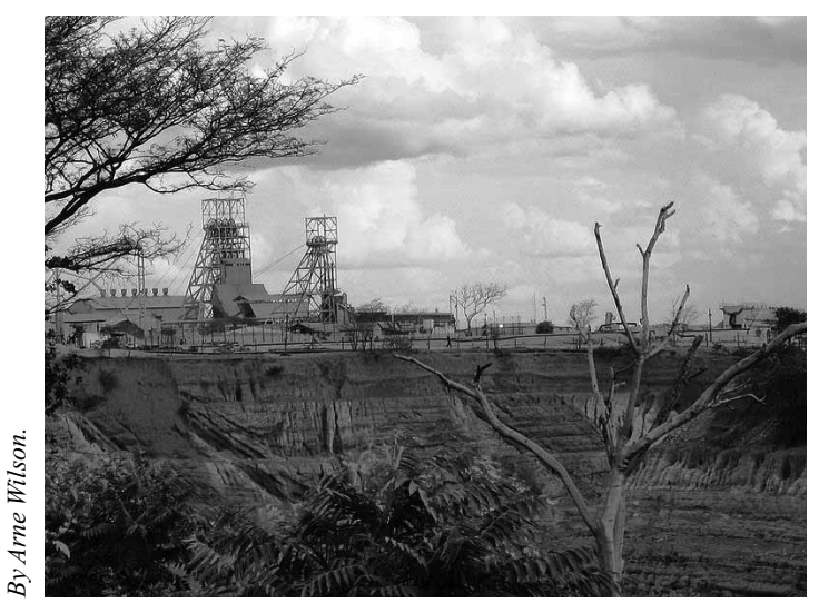
An open pit copper mine in Zambia.

The government has also taken steps to protect workers' rights, with mixed results. In response to labor unrest, the Zambian government rebuked Chinese investors and asked Kabwe-based Chinese managers at Zambia-China Mulungushi Textiles, Ltd. to stop locking its workers in its factory at night in 2004.<sup>74</sup> In southern Zambia, authorities shut down Collum Coal