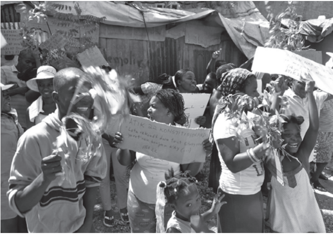
Anti-eviction sit-in at Camp Mosaic in Port-au-Prince, Haiti.

displacement that results from forced evictions. The government forcibly evicted women, threatened them with eviction, and allowed private parties to do the same rather than abide by its obligations to attend to the needs of impoverished displaced women.