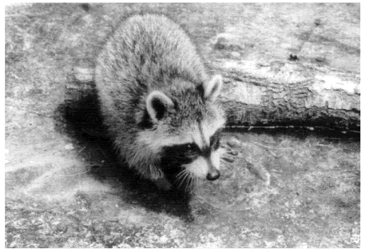
Habitat quality is used as an indicator in some wetlands assessment protocols.