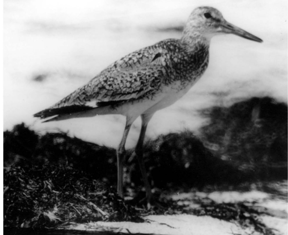
The Willet, a common breeder on salt-water marshes in Virginia, is protected by the Migratory Bird Treaty Act.

An effort to create a regional version of WET resulted in the Manual for Assessment of Bottomland Hardwood Functions (Adamus et al., 1990). This technique applies to bottomland hardwoods (BLH) in the southeastern United States. As in WET, WET-BLH evaluates functions in terms of effectiveness and opportunity, and values in terms of social significance. It evaluates the majority of wetlands functions described in WET II. In addition, WET-BLH evaluates ecological significance, economic sig-