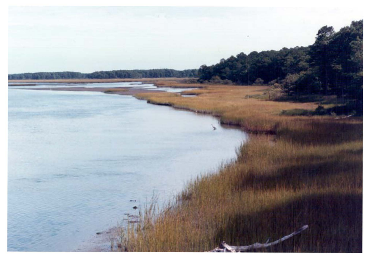
Wetland ecosystems are among the most threatened of all natural resources.

The scope of functions in the Canadian method is similar to that of WET II, but it does not clearly differentiate between wetland functions, processes, products and values. Nevertheless, it advances wetland assessment to a new dimension (Larson and Mazzarese, 1992). An assessment of both the wetland to be impacted and the proposed project are conducted using this technique. The guide consists of