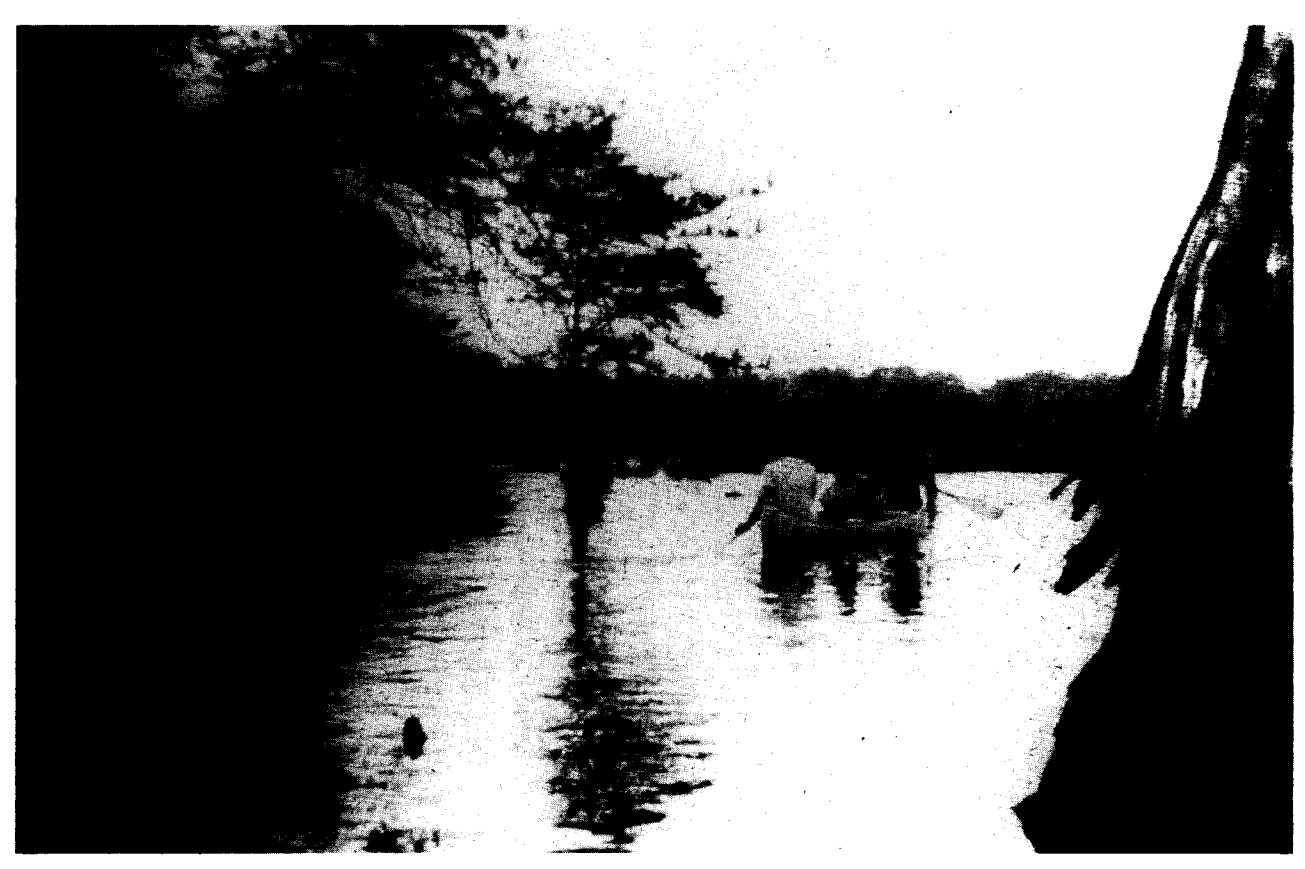
Pristine wetlands are a "natural" tourist attraction.