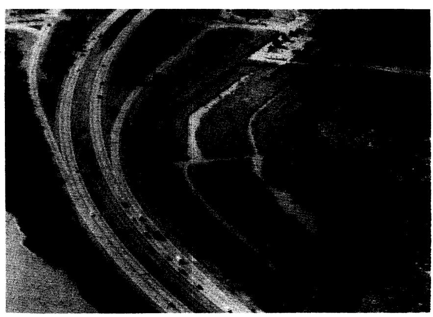
The City of Norfolk has combined tourism promotion and nature education at its Monkey Bottom facility off I-64 in Willoughby.

The first annual Eastern Shore Birding Festival was held October 9-10, 1993, and was, according to the intentions of organizers, a precursor of many more to follow. Avid birders as well as first timers came from all over the state to witness the movement of thousands of neotropical migratory songbirds through Virginia's Eastern Shore on their way down the coast to their Central and