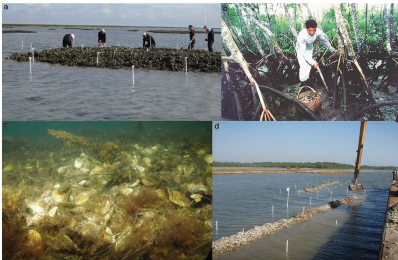
Figure 3. Oyster ecosystem services. (a) Light sensors deployed at low tide to measure filtration and changes in water clarity over a restored oyster reef in Virginia. (b) Oysters being gathered in a mangrove forest in Brazil. (c) Oyster reef restoration in progress to measure shoreline protection in Alabama. (d) Habitat provided by the Australian flat oyster in Tasmania, Australia.

and sport fisheries (e.g., Lipton 2004). Although there is increasing recognition that shellfish provide multiple ecosystem services, management for objectives beyond harvest has not yet become widespread.