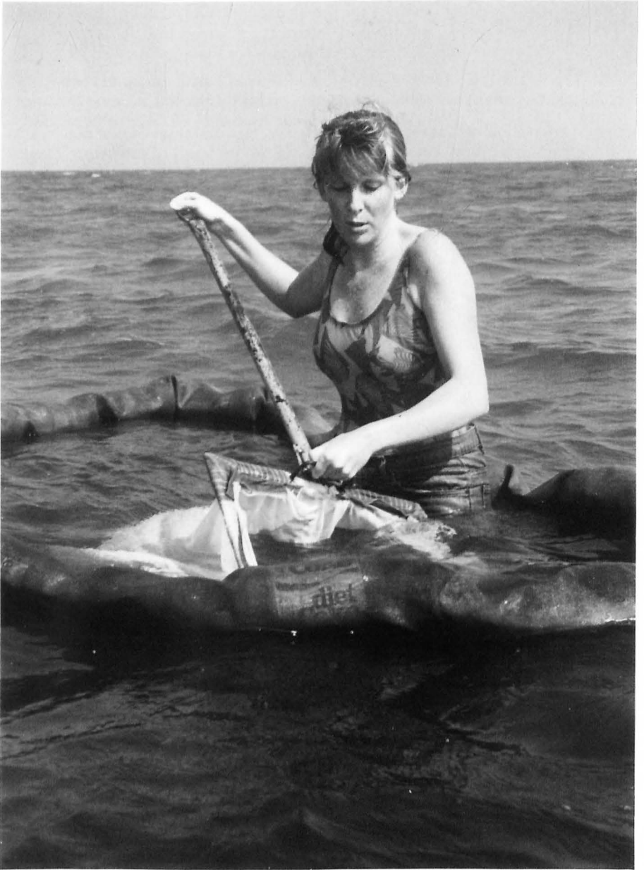
Student using dropping net for the collection of motile benthic organisms in submerged aquatic vegetation beds.