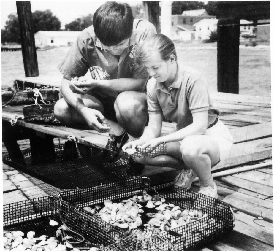
Students measure growth of young oysters in trays suspended from VIMS pier.

Students who have received a bachelor's degree from an accredited college or university and who wish to take courses in the College but who are not entering an advanced degree program, may apply for unclassified student status (post-baccalaureate). Graduate credit earned as an unclassified student may be applied toward the graduate degree upon matriculation as a regular graduate student.