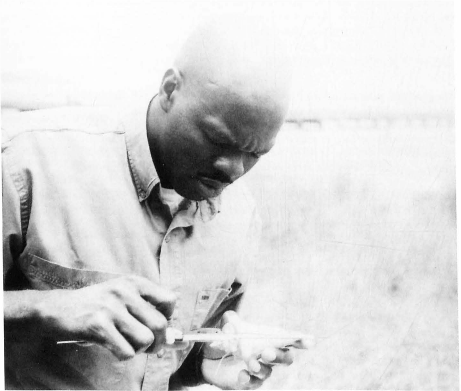
Graduate student measures a queen conch shell.