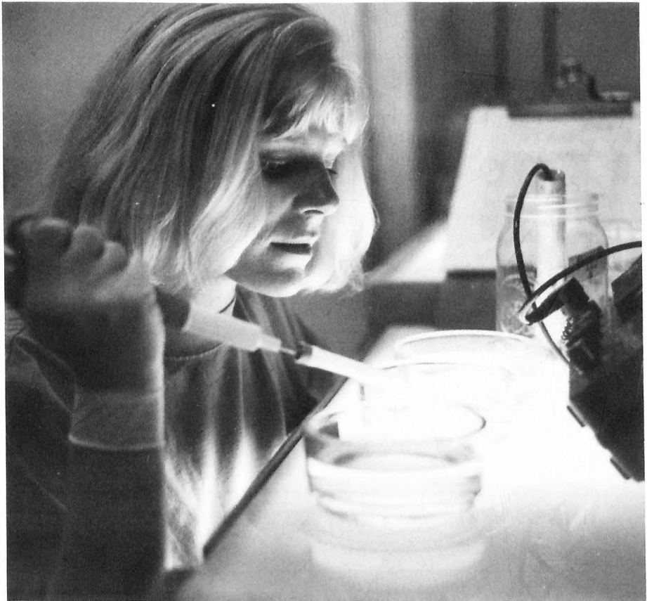
Student feeds neo-natal mysids during an EPA exposure experiment.

Environmental Chemistry and Toxicology (C&T) studies utilize a variety of specialized equipment to accomplish its research programs. A wet lab permits both flow through and static studies, while specialized sampling gear is available for field studies. Additional laboratory equipment includes four liquid and ten high resolution gas chromatographs, with a variety of general and specific detectors; two mass spectrometers are also available for the identification of unknown compounds. All equipment is linked to a computerized data system for storing and manipulating resulting output. Liquid scintillation and gamma counters permit tracer and dating experiments. An ultracentrifuge and electrophoresis and immuno-detection equipment are available for performing biochemical assays.