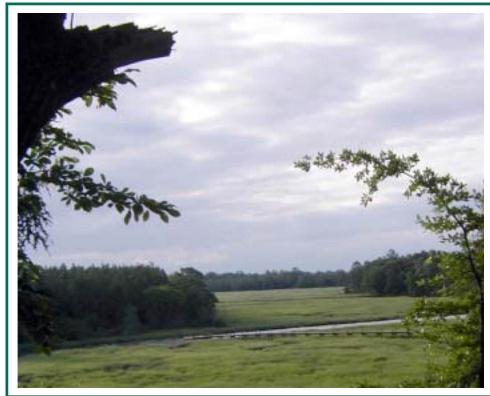
Guthrie Creek

Brief descriptions are provided on the basis of river segments, designated on a geographic basis. These summarize data from Table 4, and discuss notable features present. Four segments are defined. Segment 1 includes plates 1-2. Segment 2 includes plates 3-5. Segment 3 combines plates 6-11, and Segment 4 describes plates 12-19. Important documentation pertaining to each plate map precedes the compositions.