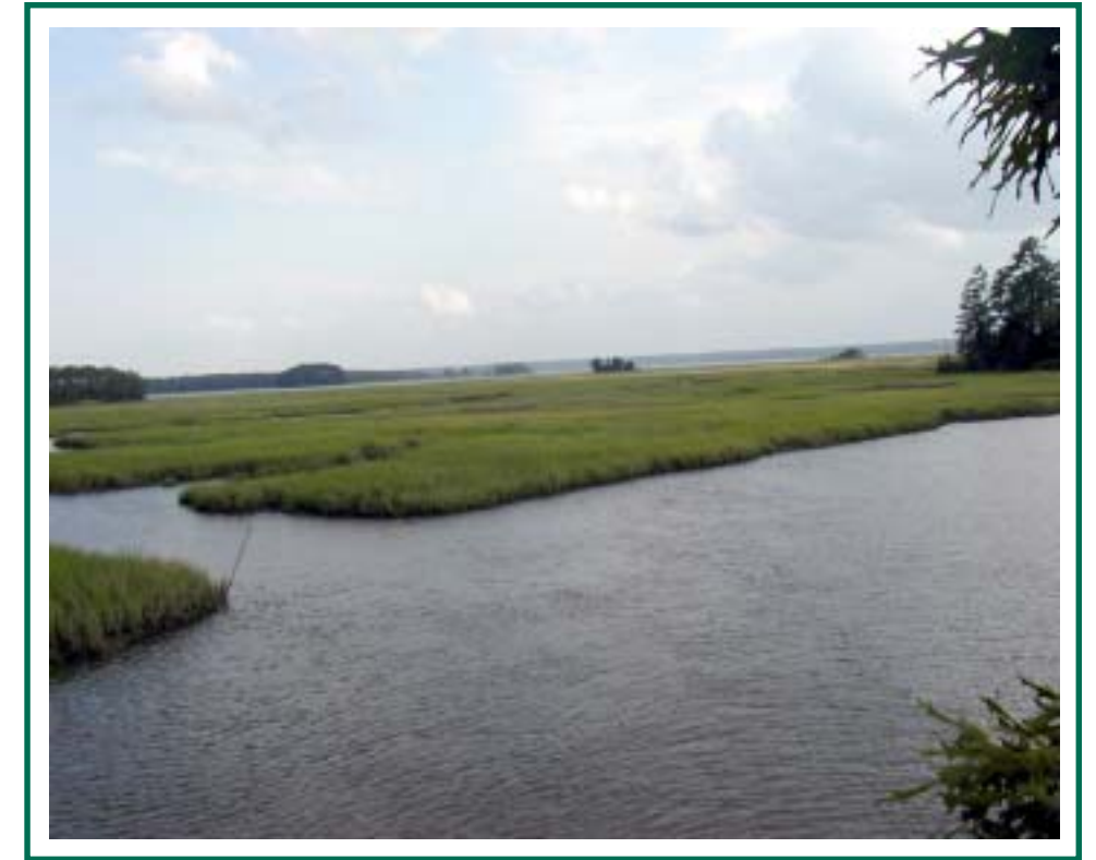
Guthrie Creek and Morris Bay

The presence of wide, embayed marshes and fringe marshes, which protect the upland, contribute to the