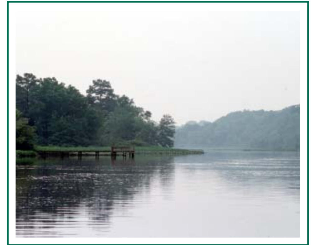
Mattaponi River, photo by James P. Blair

Dock/Pier - In this survey, a dock or pier is a structure, generally constructed of wood, which is built perpendicular or parallel to the shore. These are typical on private property, particularly residential areas. They provide access to the water, usually for recreational purposes. Docks and piers are mapped as point features on the shore. Pier length is not surveyed. In the map compositions, docks are denoted by a small green dot. Depending on resolution, docks can be observed in aerial imagery, and may be seen in the maps if the structure was built prior to 1994, when the photography was taken.