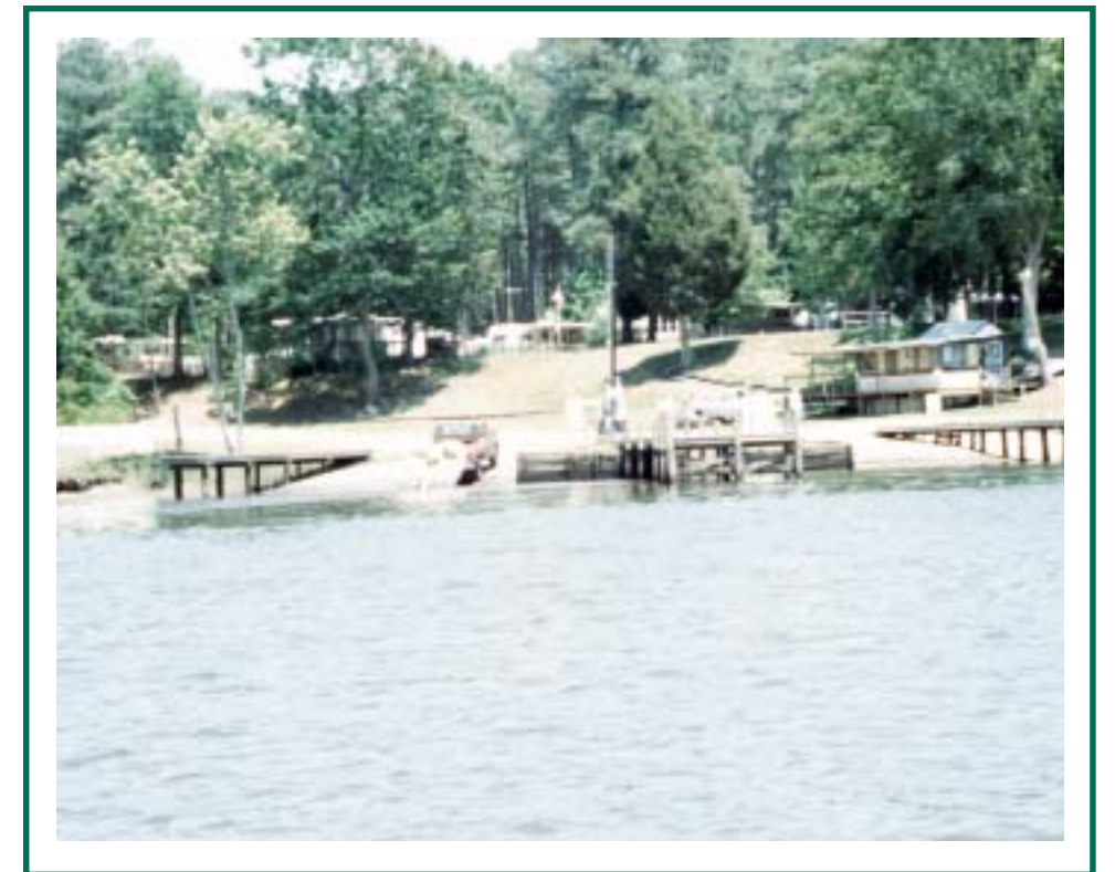
Rainbow Acres Campground

Wide, embayed marshes are common along this segment, which help to keep upland erosion down and offer bank protection. As noted in plate B, no data exists on marsh stability. Beaches, which also protect upland from wave induced erosion, are not found along this segment. Only 0.41 mile of bulkhead and 0.26 mile of riprap are found in Segment 3, owing much to the low residential density along these shorelines. Piers are relatively scarce for most, but increase in density near Courthouse Landing residential area. No groinfields were found. Due to the low fetches and embayed marshes, erosion potential due to wind waves is minor along these stretches. Erosion due to tidal currents or sea level rise is possible.