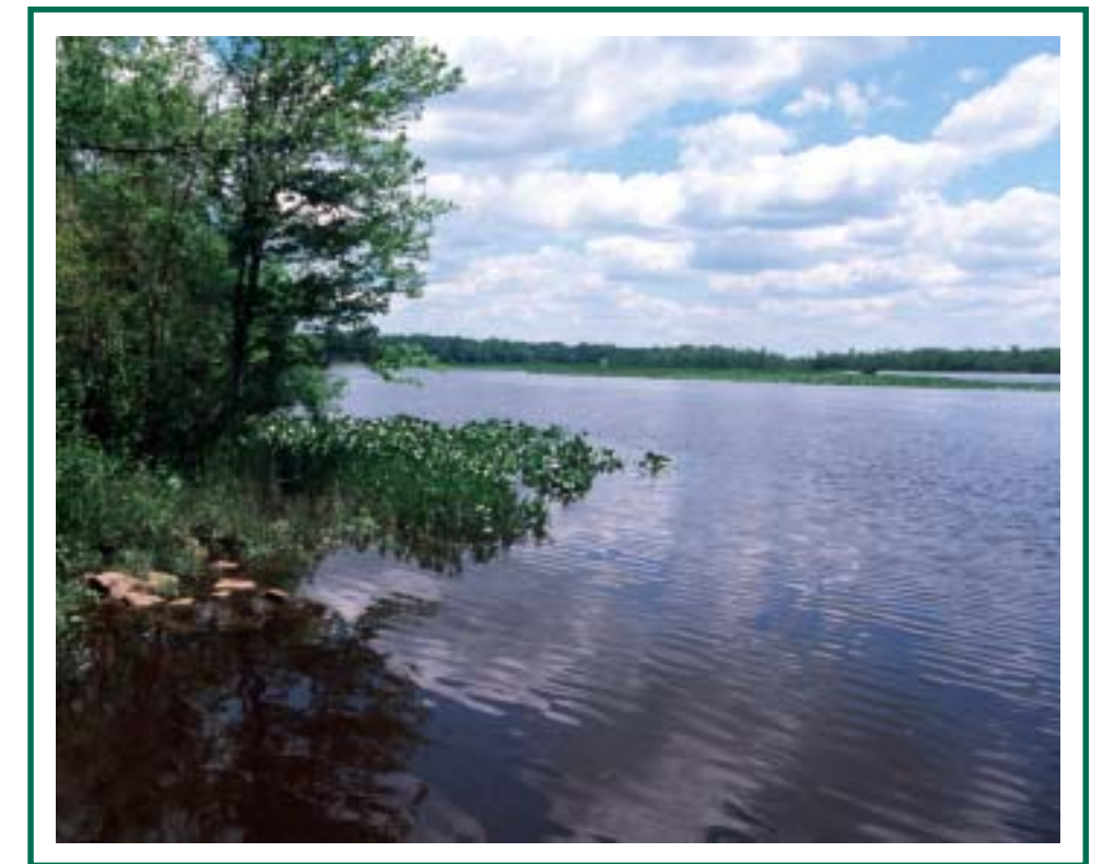
Walkerton