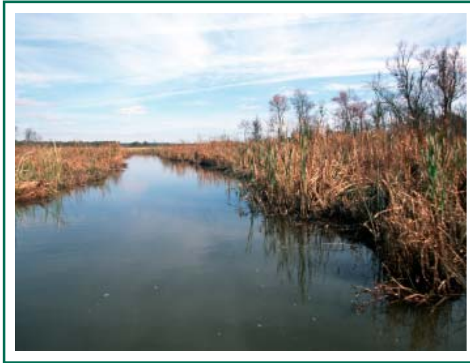
Garnetts Creek

Bank Condition: Bank heights along this segment vary from 0-5 feet to over 10 feet in height. Almost half (46.3%) of the banks are under 5 feet, while 40% of the banks are from 5-10 feet in height. Approximately 13.8% of the banks are over 10 feet. Most of these banks are characterized as low erosion. Only 1.21 miles of banks are considered to be highly eroding.