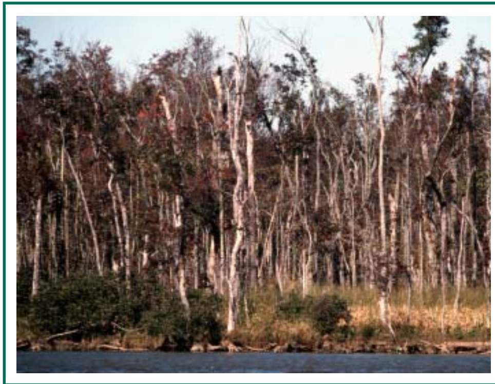
Mattaponi River

Description: Segment 3 covers the lower portion of the Mattaponi River near West Point and continues upriver to Log Landing. This segment trends from northwest to southeast and is fetch-limited. The King and Queen county shore of the lowest portion of the Mattaponi is absent the industrial character present along King William county shoreline. In the vicinity of the Route 33 bridge, the shore is predominantly residential land use. Beyond West Point, the river meanders, and wide embayed marshes dominate. Approximately 19.25 miles of shoreline was surveyed in July and August, 1998 out of a total 36.48 miles of shoreline. The bulk of the shoreline that was not surveyed is