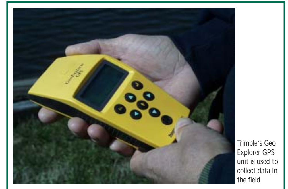
Trimble's Geo Explorer GPS unit is used to collect data in the field

Bank height is described as a range, measured from the toe of the bank to the top. Bank stability characterizes the condition of the bank face. Banks which are undercut, have exposed root systems, or exhibit slumping of vegetation or other material qualify as a "high erosion". At the toe of the bank, natural marsh vegetation and/or beach material may be present. These features offer protection to the bank and enhance water quality. Their presence is noted in the field, and a general assessment (stable/unstable) describes whether they are experiencing any erosion. Sediment composition and bank slope cannot be surveyed from a boat, and are not included. Bank cover was added as a feature to be surveyed subsequent to data collection for this inventory. Other Shoreline Situation Reports will include bank cover as a descriptive attribute.