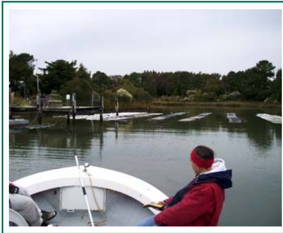
Collecting data with Trimble's Geo Explorer GPS unit

The GPS units are preprogrammed with the complete suite of shoreline features described in section 2.2. These features are stored in a "data dictionary" prepared specifically for this project. As features are observed in the field, the GPS unit tags each geographic coordinate pair with the attribute's code. The survey, therefore, is a complete set of geographically referenced shoreline features.