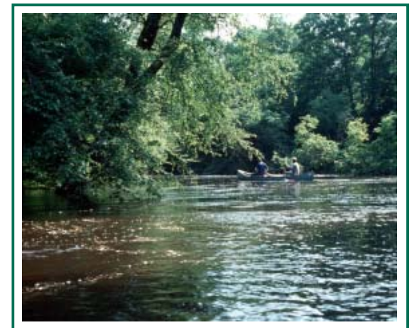
Headwaters of the Mattaponi