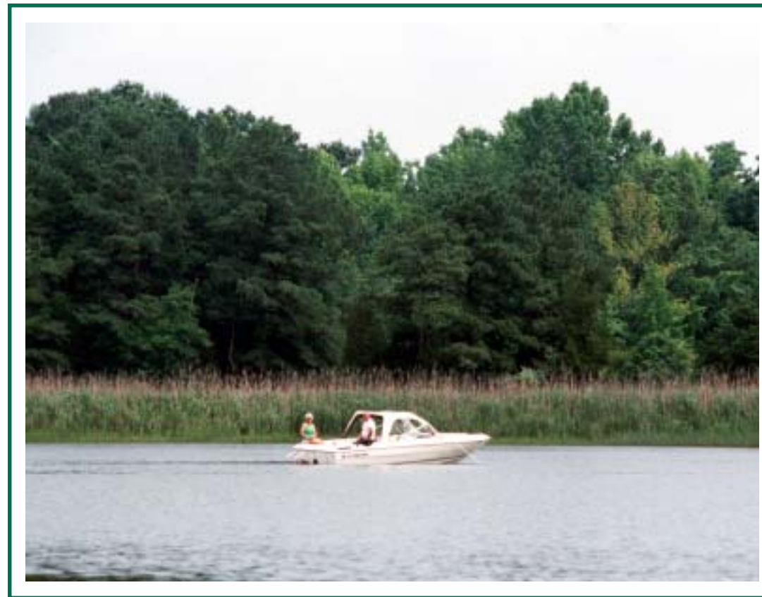
Mattaponi River

Location: Headwaters of river Major River: Mattaponi Total Shoreline Miles: 6.55 Shoreline Miles Surveyed: 6.35 Survey Date(s): 8/6/98 Plate Rotation: 61 degrees W