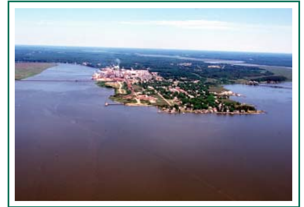
York River, West Point, photo by Dwight Dyke.

Shore Condition: Higher fetches along the shoreline in this segment result in more marsh erosion, especially near Roane and in Morris Bay. Shoreline stability is good, and marsh erosion is low in Guthrie Creek. Along the mainstem of the York River, fringe marshes are common, and a few beaches exist. The extent of marsh erosion can not be determined since data was not collected on marsh condition for much of this shoreline. Historic erosion rates are slight with no shoreline change in Morris Bay, and for parts of the York River mainstem (Byrne and Anderson, 1978). Moderate, noncritical erosion rates characterize the shoreline from Belleview to Goff Point, delineated in Plate 5. This area has a historical erosion rate of 1.1 to 1.6 feet per year. Shoreline erosion structures are more frequent in this segment as 8.6% of the surveyed shoreline is bulkheaded or has riprap. Piers and boathouses are abundant near Belleview, and north of Goff Point.