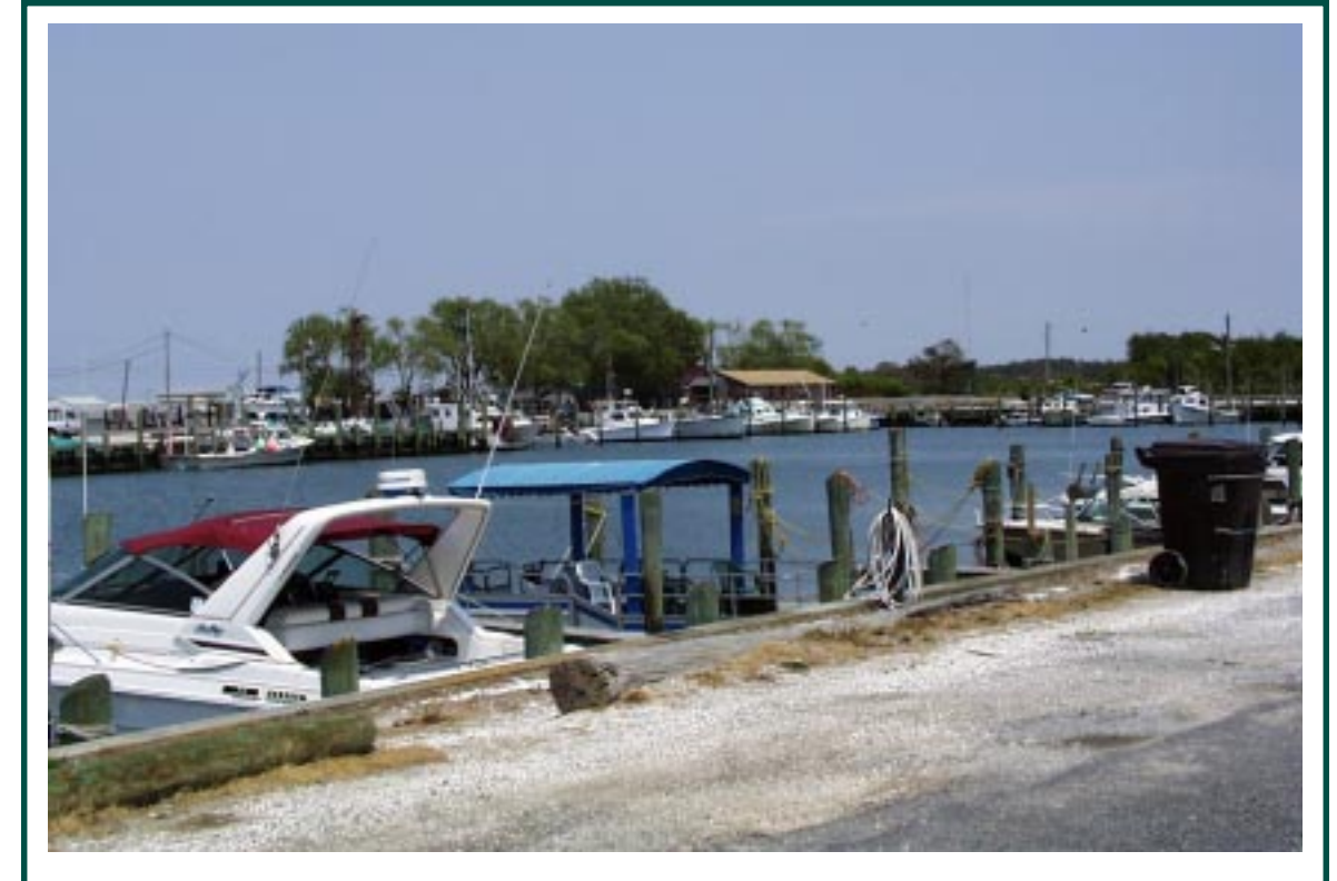
Commercial marina on Chincoteague Island.

Shore Condition: Erosion control structures extend 8.01 miles along the Chincoteague Island shore. This figure applies to reaches surveyed in the field. Erosion control structures can not be observed using the imagery applied to remote sensing mapping. Therefore, it is conceivable that more structures like riprap or bulkheads are in place. Chincoteague has 4 areas classified as either marinas or community boat slips. Public access to the water can be gained from one of three public landings. Private piers number approximately 120. This does not include piers and slips associated with the marinas or community facilities.