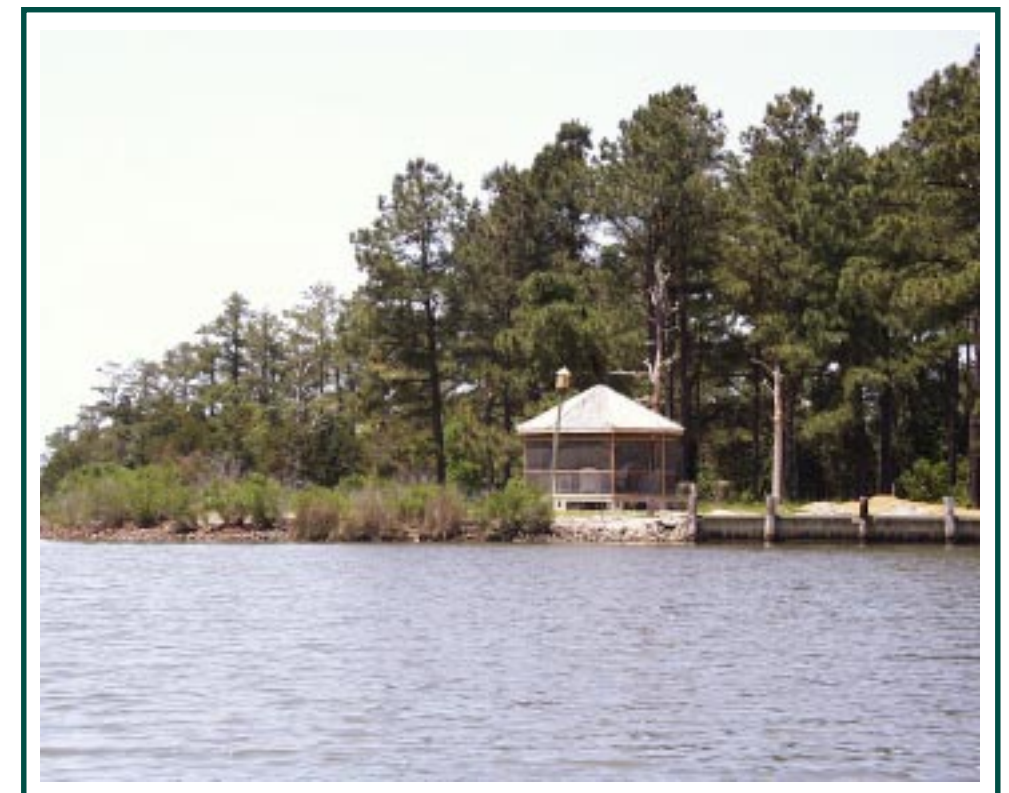
Stabilization along Doe Creek.

Location: Deep Creek and portion of Rock Gut. Major River: Deep Creek Reach(s): 81 (partial), 82 (partial), 83, 84, 85, 85a, 86, 86a (partial), 87 (partial), 88 (partial), 109 (partial) Total Shoreline Miles: 27.50 Shoreline Miles Surveyed: 27.50 Survey Date(s): 4/27/2000 and 4/28/2000 Plate Rotation: 90 degrees W Scale: 1:12,000