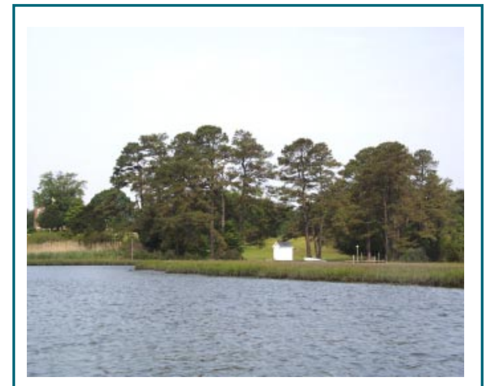
Fringe marshes along Gargathy Creek

Location: Chincoteague Island from Route 2113 to just southwest of Archie Cove. Major River: Chincoteague Bay Reach(s): none Total Shoreline Miles: 17.44 Shoreline Miles Surveyed: 17.23 Survey Date(s): 5/17/2000 Plate Rotation: 45 degrees E Scale: 1:12,000