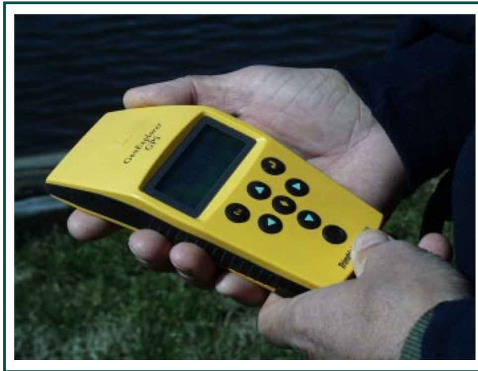
A hand-held Trimble GeoExplorer logs field data observed from the boat.

Although the Trimble GeoExplorers are capable of decimeter accuracy (~ 4 inches), the short occupation of sites in the field reduces the accuracy to 5 meters (~ 16 feet). In many cases the accuracy achieved is better, but the overall limits established by the CCI program are set at 5 meters. This means that features are registered to within 5 meters (~ 16 feet) (or better) of their true position on the earth's surface. In this case, positioning refers to the boat position during data collection.