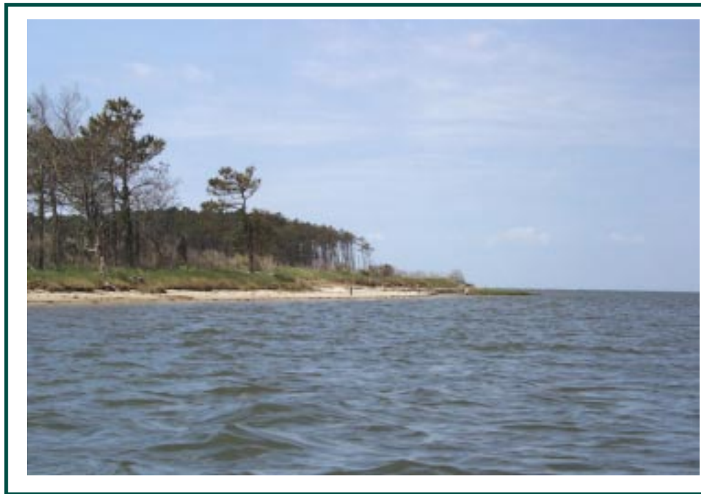
Sandy beach in Craddock Creek.

Bank Condition: Bank heights in segment one were observed between <5-30 feet. Ninety-seven percent of all bank heights along this segment are below 5 feet, and these are considered to be experiencing low erosion. Since a large component of these miles were surveyed remotely, several assumptions are made for these areas. First, USGS topographic maps were used to determine bank height at the shore. Therefore, the accuracy of these maps must be considered. Second, since most of these remote locations are along small tidal creeks, exposure to high wave energy is considered to be low, and therefore bank erosion minimal. This assumption does not, however, consider that tidal currents can be responsible for significant undercutting in these settings, so this assumption may not be accurate. Low bank erosion is often reflective of bank cover. Banks surveyed remotely were all assumed to be “total” cover. No banks exceeded a range of 10-30 feet. According to Hobbs et.al. (1975), flood hazard potential ranges between high to low, non-critical. Generally, the Bay shoreline and the lower reaches of larger creeks were designated a high potential for flooding, middle creek reaches as moderate, and upper reaches as low. Data collected from this survey indicates that a significant amount of shoreline at the upper reaches of creeks are at or below 5 feet. These areas, therefore, are prone to flooding during high water.