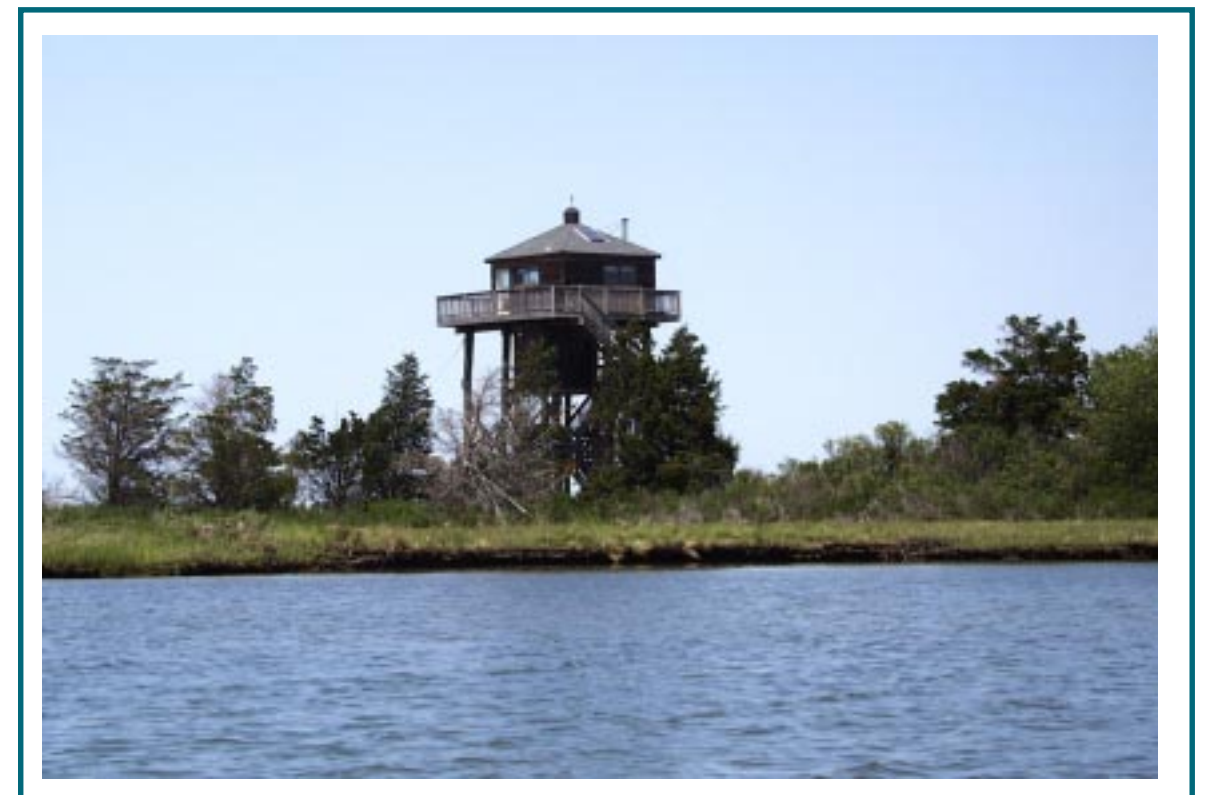
Tower at entrance to Craddock Creek.

Location: Hyslop Marsh Major River: Chesapeake Bay Reach(s): 137, 138 (partial), 139, 140, 141, 142 (partial) Total Shoreline Miles: 17.77 Shoreline Miles Surveyed: 17.77 Survey Date(s): 4/26/2000 and 5/15/2000 Plate Rotation: 90 degrees W Scale: 1:12,000