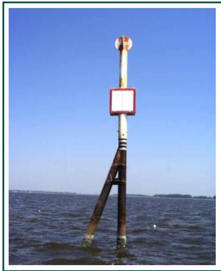
Virginia-Maryland border on the Pocomoke River.

The shoreline situation is described for conditions in Accomack County along the bayside primary and secondary shoreline, selected seaside creeks, and Chincoteague Island. Characteristics are described for all navigable tidal waterways contiguous to these shorelines. A total of 882.53 miles of shoreline are described. Just over 193 miles were surveyed in the field. The majority of the shoreline (= 689 miles) is described using image interpretation techniques and ancillary data sources. These areas are mainly tidal creeks with restricted openings at the mouth, or headwater channels of secondary creeks without sufficient water depth to permit navigation. For remotely sensed areas, photo interpretation was made using DOQQs to detect land use, natural buffers, and shoreline structures where possible. Along these tidal channels, upland banks are assumed to be well protected by vegetation, and erosion low. It is possible,