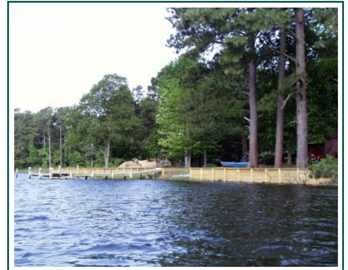
New bulkhead construction on Occohannock Creek.

Land Use: Sixty-four percent of the riparian area is scrub-shrub. The riparian area is restricted to the first 100 feet of upland immediately adjacent to the shore. The extensive scrub-shrub is not untypical along the inland margins of expansive marshes. Grass cover constitutes 21% of the remaining adjacent land use. These parcels characterize the rural residential landscape of the Eastern Shore. Some, however, may represent agricultural tracks, where farming practices could not be confirmed. In 4% of this