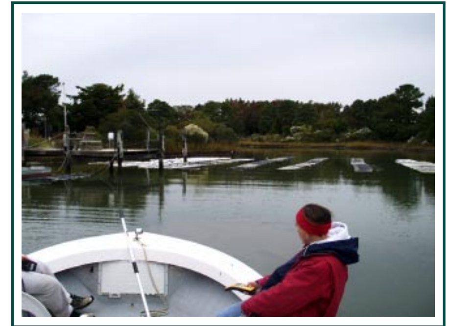
A GPS operator observes shoreline conditions from a shoal draft boat.

Bank height is described as a range, measured from the toe of the bank to the top. Bank cover is an assessment of the percent of either vegetative or structural cover in place on the bank face. Natural vegetation, as well as rip rap are considered as cover. The assessment is qualitative (Table 2). Bank stability characterizes the condition of the bank face. Banks which are undercut, have exposed root systems, down vegetation, or exhibit slumping of material qualify as a "high erosion." At the toe of the bank, natural marsh vegetation and/or beach material may be present. These features offer protection to the bank and enhance water quality. Their presence is noted in the field, and a general assessment (low erosion/high erosion) describes whether they are experiencing any erosion. Sediment composition and bank slope cannot be surveyed from a boat, and are not included.