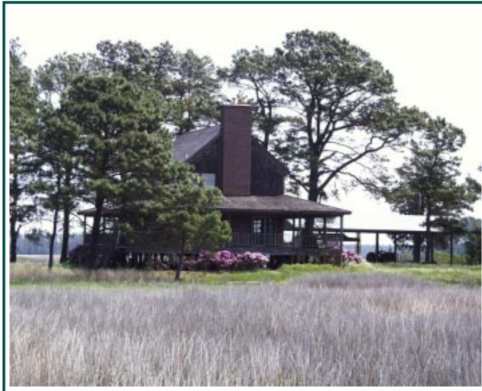
Residential housing on Guilford Creek.