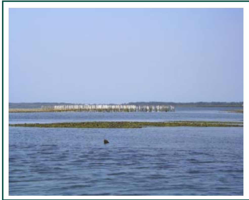
Old oyster flats on Chincoteague.

Bank Condition: Bank heights along Chincoteague Island are all less than or equal to 5 feet. Remotely sensed areas use USGS topographic maps to determine bank height at the shore. Erosion is considered low, but undercutting may not be accurately interpreted if water levels were high. All remotely sensed shoreline is assumed to be low erosion. More than half the shoreline surveyed in the field has been stabilized with shore protection structures. The presence of marshes also offers natural protection to the bank. Most of the banks evaluated both in the field and remotely are considered fully covered. This includes vegetative and structural, and can explain the high degree of stability as well.