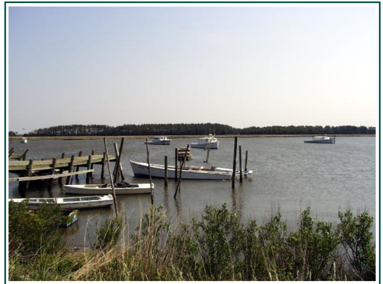
Workboats on Guilford Creek.

For publication purposes the county is divided into a series of plates. Most plates are printed at a scale of 1:12,000. Plates 1, 11, and 17 are published at 1:24,000. The number of plates is determined by the geographic size and shape of Accomack County. An index is provided in Chapter 4 which illustrates the orientation of plates to each other. The county was divided into 46 plates (plate 1a, 1b, 1c, etc.), for a total of 138 map compositions.