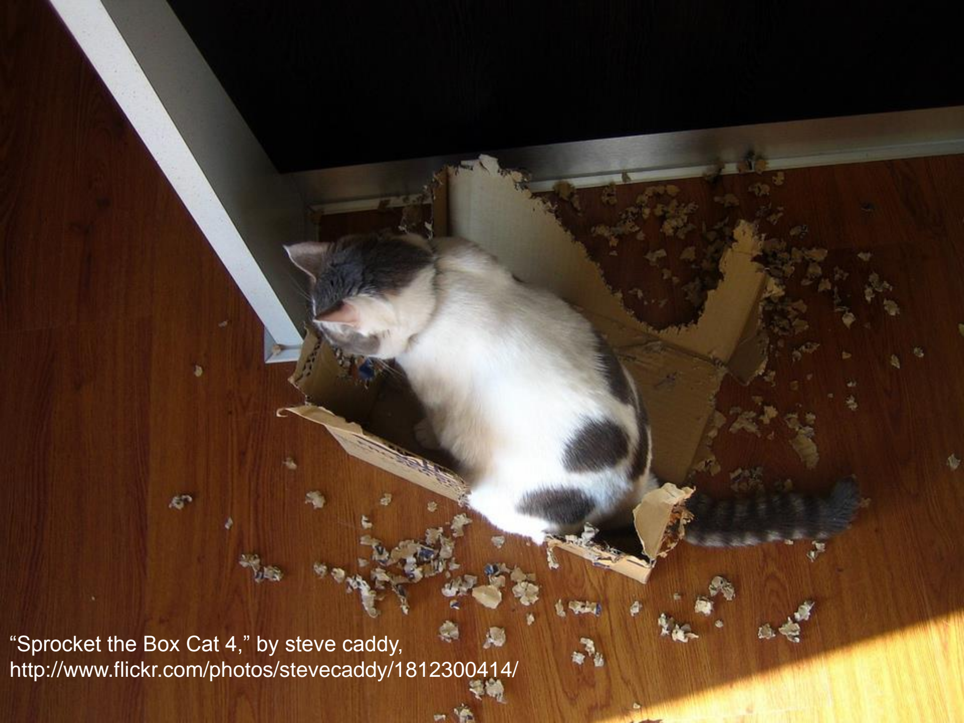
“Sprocket the Box Cat 4,”