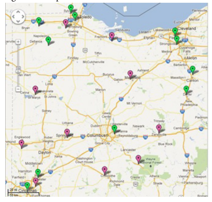
Figure 1 shows the geographic distribution of the organizations in the state. Nursing homes are indicated by green pointers and home care agencies are pink.

Note: Not all organizations provided information for each item