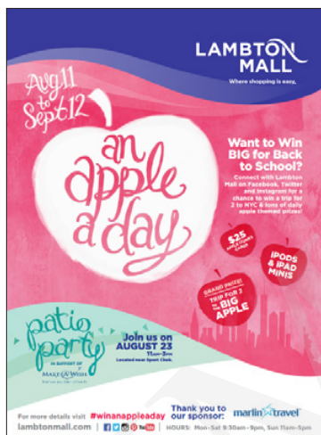
Figure 1a. Advertisement of the Lambton Mall ( http://click-sarnia.com/apple-day-lambton-mall-contest/ , retrieved 20 February 2016)

Moreover, modern advertising business relies heavily on the persuasive power of proverbs, frequently building its eye-catching slogans upon their structure. As an illustration, consider the advertisement by the Lambton Shopping Mall (Figure 1a).