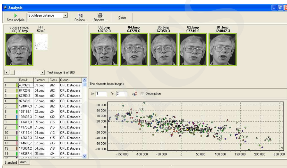
Fig. 3. Sample results of recognition in the FaReS environment (overall recognition rate equal to 95%)

The classification employs feature space created for all face images in the database. A query face is projected into it and Euclidean distance is being calculated. Two alternative distances are taken into consideration: the first one is a distance to all elements, whereas the second one is the distance to the centers of all classes only ( \bar{X}^{(k)} ). The latter approach is easier to perform and requires much fewer computations, however, its efficiency is lower in the case of irregular clusters. One of the recognition experiments is presented in Fig. 3. It was performed in "FaReS-Modeller" Environment [9]. As it can be seen from the figure below, it gives 5 nearest images from the database for a query image ("source image" in the picture), sorted in the decreasing similarity order.