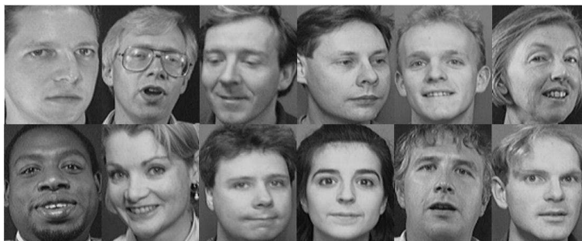
Fig. 1. Example images from AT&T database used in experiments