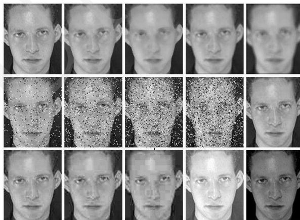
Fig. 5. Example original image and its distorted variants: median filtered (mask 3 \times 3 and 5 \times 5 ), low-pass filtered (mask 3 \times 3 and 5 \times 5 ), contaminated by the salt and pepper noise (5%, 10% and 20% of pixels), JPEG compressed (quality: 60%, 40%, 20% and 10%) and intensity offset change (+20,-20), respectively