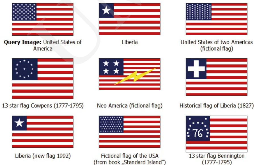
Fig. 3. Sample retrieval results. The most up-right image is a query object.