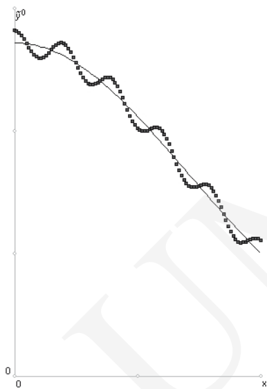
Fig. 2. The exact solution and \tilde{y}_i^0 for l = 2, T = 1, \beta_0 = 0.5, E_S = 10^{-1}, h_i^0 = 0.02.