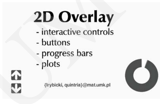
Fig. 4. Presentation of the 2D Overlay: two buttons, a static label and a circular progress gauge to-gether with a slide exhibit.

up.onClick = &display.camera.forward; down.onClick = &display.camera.back;