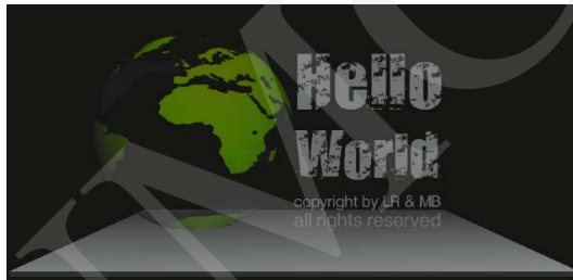
Fig. 5. A complex exhibit with an animated rotating object and a column of text labels.

The above line creates a Slide exhibit, which will contain a title and a bullet list in a column. The Slide constructor creates Label objects out of the string constants and determines their size. The title will be automatically resized to take up the whole exhibit width and the bullets in the list will be resized to have the same font size.