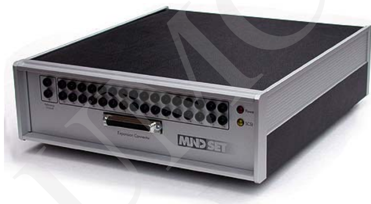
Fig. 1. Mindset MS-1000 EEG System.

MindSet MS 1000, manufactured by Nolan Computer Systems, is used as the hardware source of an EEG signal (Fig. 1). It is a real-time device containing a 16-channel analogue differential amplifier which receives signals from cap electrodes and amplifies them 32000 times. An amplified analogue signal is converted into a digital one as it goes through sample-and-hold circuits and an analogue-to-digital converter. Inside the device, there is a 32kB RAM buffer enabling it to withstand arrhythmical cooperation with a PC [9].