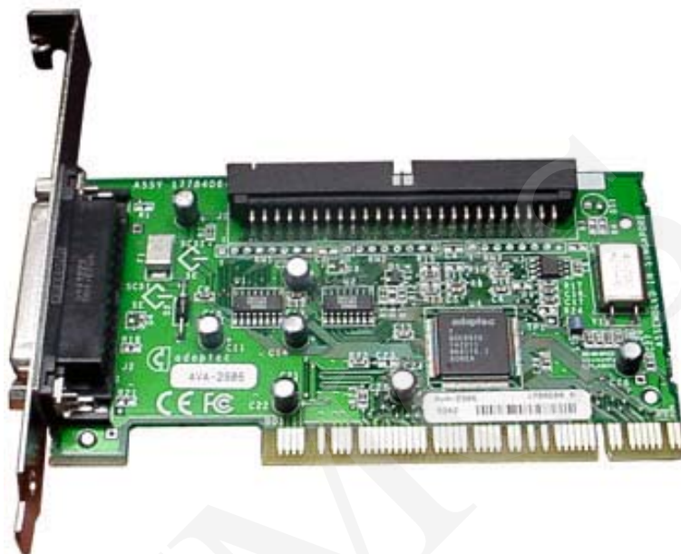
Fig. 2. Adaptec AVA 2906 controller.

For practical reasons (good quality development tools and documentation without restrictive license limits), our work is carried out in the GNU/Linux operation system environment with the application of a gcc compiler.