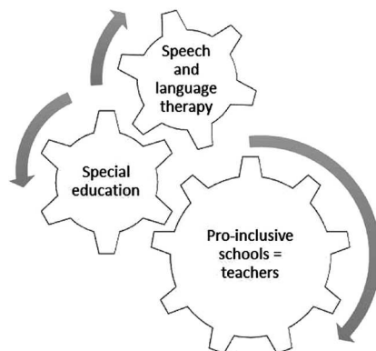
Figure 1. Model of collaboration approach to intervention in pupils and students with communication disabilities

results from the fact that teachers and speech therapists express desire to intensify their practical training as well as to increase their knowledge and collaborative practice; but, at the same time, they also express frustration with the current system of inequality concerning funds, personal commitment and others 14 .