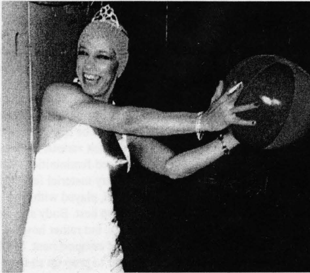
Figure 2: The Drag Races © Darrin Hagen

The Drag Races did not involve high-speed cars. They were more like a Crossdresser's Olympics. Every May long weekend, Flashback prepared for the onslaught of madness. Before the Step-down, before the Crowning, before the queens painted, the staff would arrive, clean the club, warm up the barbecue, and fill up the dunk tank. The alley was blocked off at both ends. The beer cooler was stuffed with wading pools full of lime jello, and I was going over the list of events for the day: