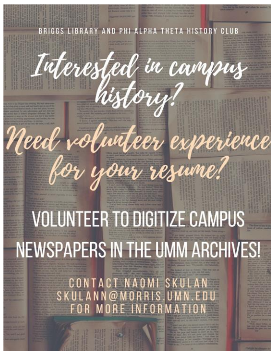
Figure 1: Historic Campus Newspaper Digitization Project flyer

In addition, the History Club set up a table during meal times near the dining hall to describe the project and encourage fellow students to sign up to volunteer. From these methods, 14 dedicated student volunteers were brought to the project.