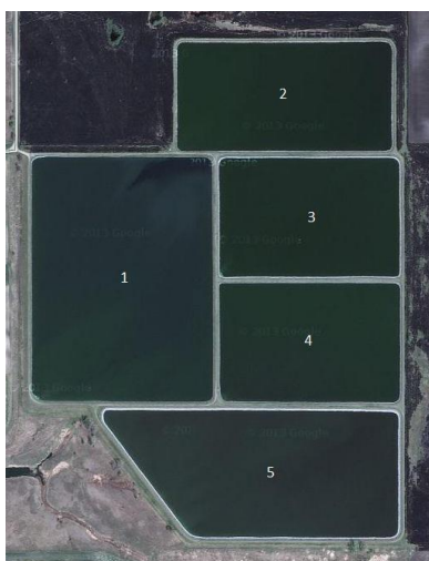
Figure 1: Morris Sewage Treatment Ponds

The purpose of this project is to measure the amount of chloride being deposited into the Pomme de Terre River due to household water softening units. Morris drains its water from sewage treatment ponds into the Pomme de Terre River. This action doesn't just cause issues locally; the Pomme de Terre River watershed deposits all that enters it elsewhere, draining an area of 875 square miles in agricultural regions of Minnesota, and eventually flowing into Marsh Lake on the Minnesota River.