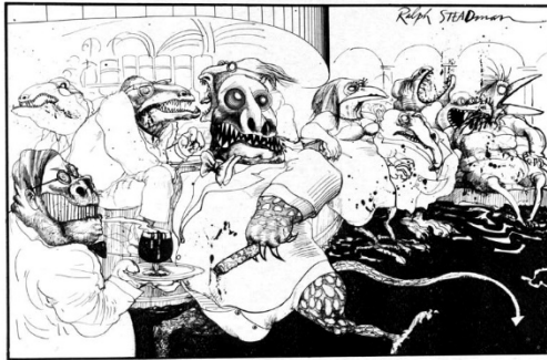
Figure 2: Lizard Lounge (Illustration by Ralph Steadman)

press table as crazed lizards spilling blood throughout the hotel bar. The text is highlighted by Ralph Steadman's gruesome illustrations such as the photo below of Thompson's hallucination.