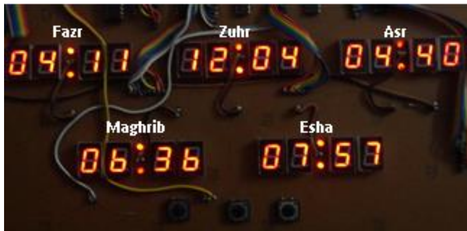
Figure 3. Test case result

Figure 3 shows a sample /partial test case result where 5 prayer time of Muslim calendar are displayed. It is possible to add more display unit on the board and can be controlled by using only one seven segment decoder and FPGA using scanning technique.