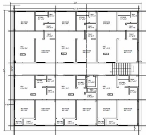
FIG 5.1 BUILDING VIEW OF PLAN