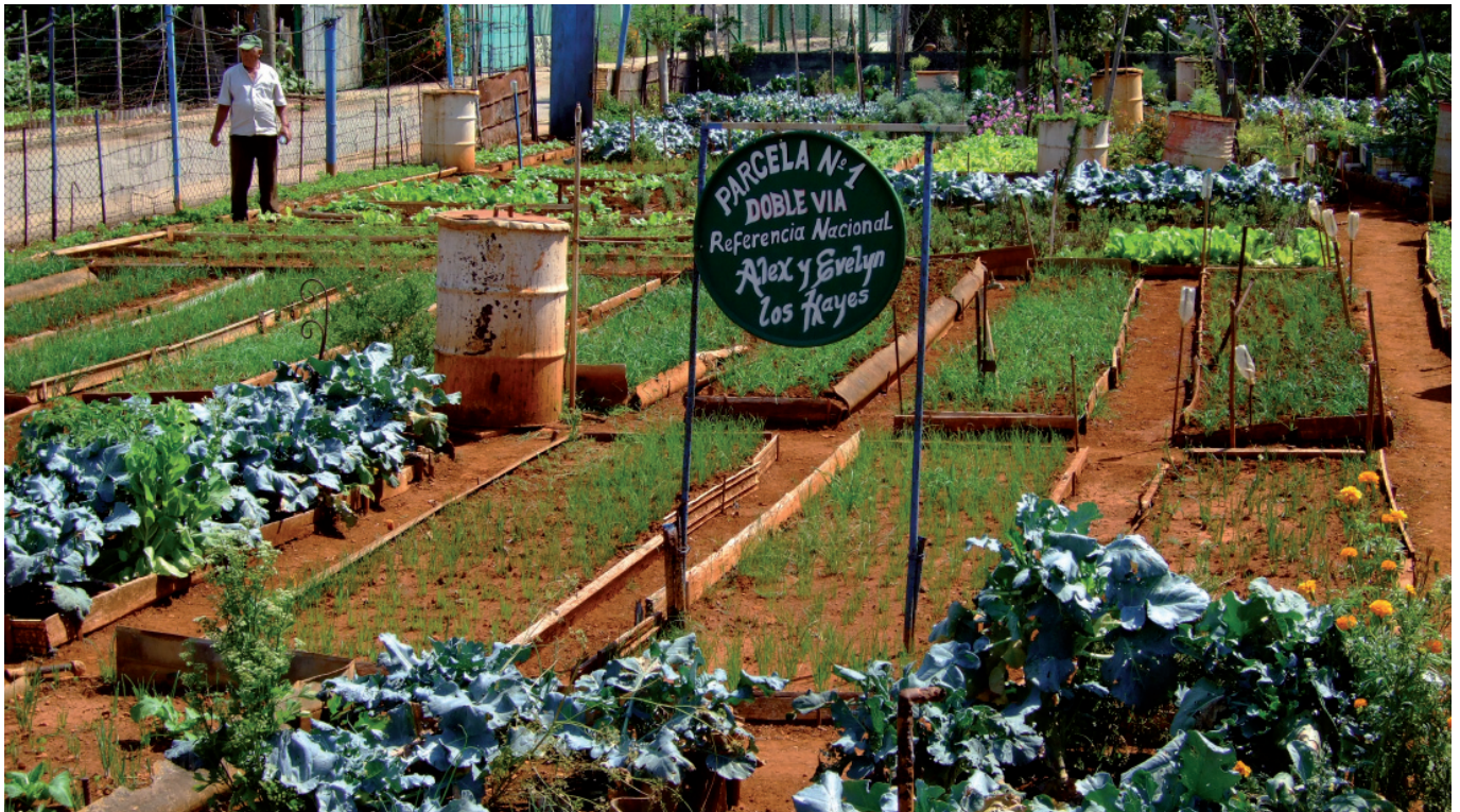
Urban agriculture on the outskirts of Havana

Urban agriculture is also a valuable driver for innovation. For example, it can change people's perceptions of the role of the farmer. Traditionally something passed from father to son and agriculture is currently struggling to attract newcomers to the profession. Urban agriculture offers a chance for new types of farmers to emerge from a wide variety of backgrounds. They do not always intend to become life-long farmers. They may turn to this activity for a few years, as just one project or one more experience among life's many. Even if the image of the profession that they convey, albeit involuntary at times, can attract criticism from traditional farmers for a number of reasons, at the very least it helps to alter public perceptions of farmers and to rebuild bridges between the urban and rural worlds.