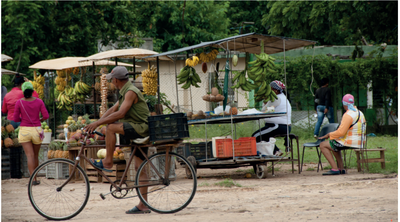
Fruit market in Cuba

since urban agriculture is unable to meet all food needs, it is important to keep the phenomenon in proportion. Even if peri-urban agriculture is included in the overall result, market gardening still prevails even though it represents a very small portion of our daily diet. For example, cereals and oilseeds are almost never grown in cities.