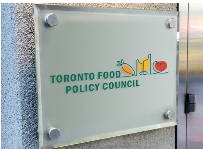
Logo of the Toronto Food Policy Council - ©Neglia Design

But urban agriculture cannot really pretend to offer a pathway toward food independence for cities. Plots of city land devoted to growing crops in cities are tiny in comparison to current production and food needs. And