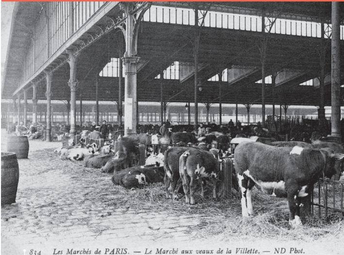
834 Les Marchés de PARIS. — Le Marché aux veaux de la Villette.

Montpellier SupAgro, Secretary General of the UNESCO Chair in World Food Systems