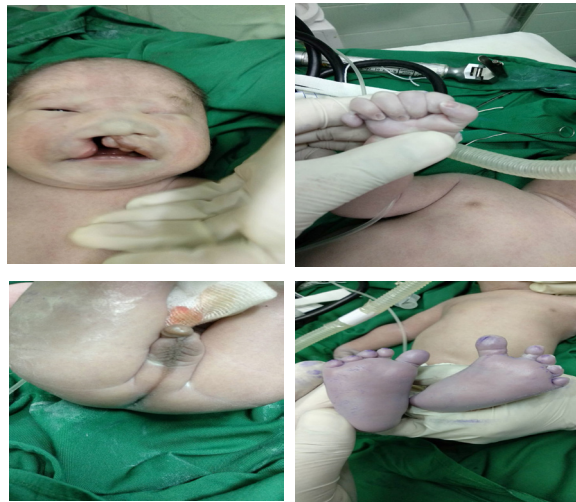
Figure 3 Congenital anomaly with micrognathia, labiognatopalatoskizis, polydactily, and undescended testis.