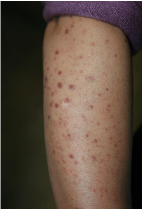
Figure 1: Pruritic and Purple Papules on the Right Forearm of a 43 Years Old Woman with a Diagnosis of Cutaneous Lichen Planus (LP).

LP is a chronic, inflammatory autoimmune disorder affecting mucocutaneous membranes such as the skin, oral cavity, and vagina. Cutaneous LP, the most common type, is classically characterized by pruritic, purple, bilateral papules (Fig. 1) [4, 5]. The disorder is uncommon, presenting in roughly 1% of the population [5]. Middle-aged adults are most commonly affected by LP, with the disorder showing a slight female predominance [6].