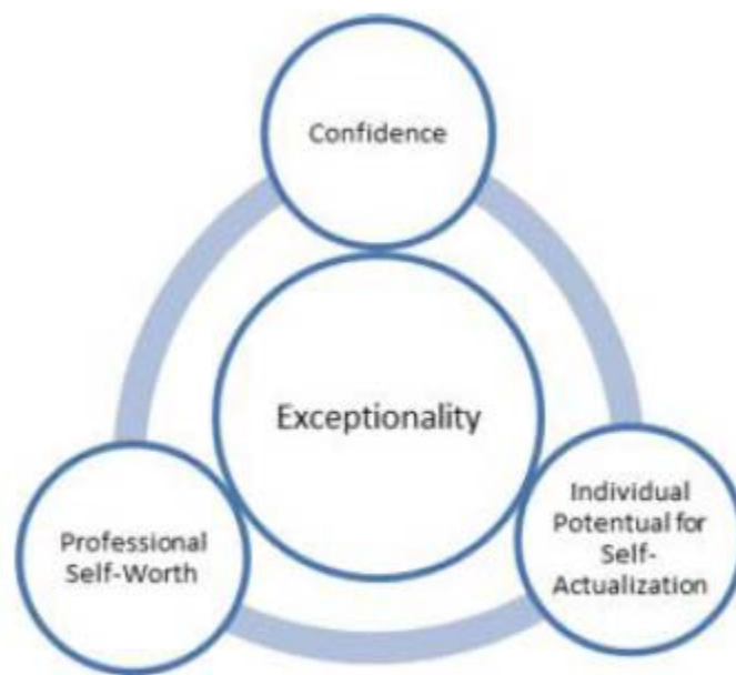
Figure 2. Socialized self: the intrinsic foundation and forces of doctoral agency

stimulated and guided participants' actions and decisions in academia. The interconnectedness of the individual forces constituted the participants' agency, which was the core of their doctoral self (Figure 2). Participants' meaning of Blackness or Whiteness or other ethnicity originated from the larger, historical and social context where racial/ethnic minority was historically associated with the issues of college access, low-income class, academic preparedness, prejudice or discrimination (Baker and Velez, 1996; Bowen et al., 2005; Hu and St. John, 2001; Olivas, 2006; Pryor et al., 2007, St. John, 2002, 2006a, 2006b). As all of them were connecting their stories directly or indirectly with the historical and social contexts (Figure 3), they each tended to imply that they were an exception rather than a norm in academia. In such a manner, the meaning of a sense of exceptionality emerged from the participants' interpretations of the role of their racial/ethnic and socioeconomic background in their academic journeys and experiences.