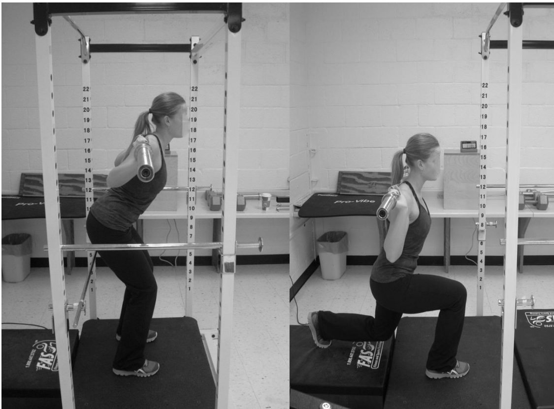
Image 1: Demonstration of Laboratory ; (1a; left) Isometric and isotonic squats will be completed to a knee angle of 120^{\circ} , (1b; right) left and right leg lunges should be completed in alternating fashion.

Isometric squats were completed to a knee angle of 120^{\circ} with the legs shoulder width apart. Participants were instructed to hold 40% of their body weight at the 120^{\circ} knee angle for 10 seconds (see Image 1a), then return to upright standing position for 5 seconds while still holding the weight. This process was completed 4 times, totaling 1 minute of activity. The participants were given another 1 minute bout of rest where they can move around if they desired to do so.