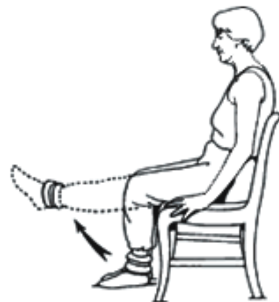
Seated Knee Extension