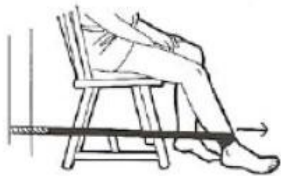
Seated Knee Flexion