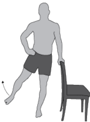
Standing Hip Abduction