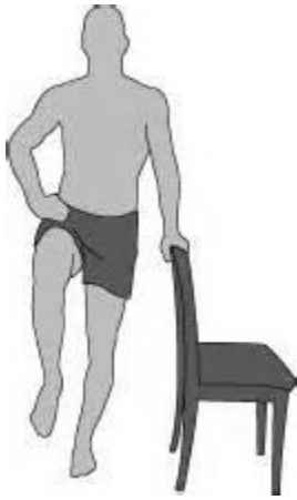
Standing Hip Flexion