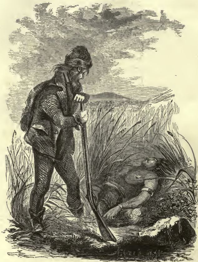
RANGER'S BEST SHOT.