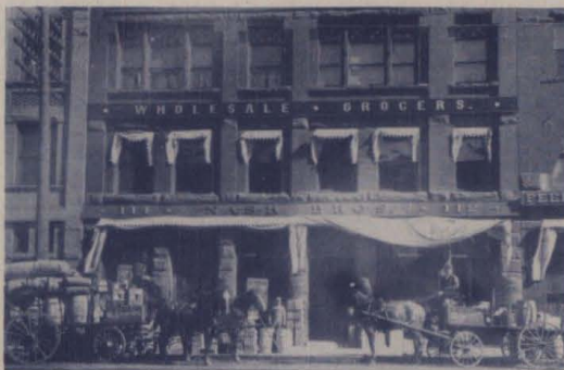
Nash Brothers Wholesaler, 112-114 North Third Street, Grand Forks 1890's.

Nash Finch Company records contain 48 linear feet of financial records dating from 1911 to 1979, although the majority date from 1919 to 1960. The records detail the financial activities of the Nash Brothers Company, Nash Coffee Company, Nash Finch Company, the Nash Shareholders Company, and the Nash Foundation. Three indexes offer detailed access