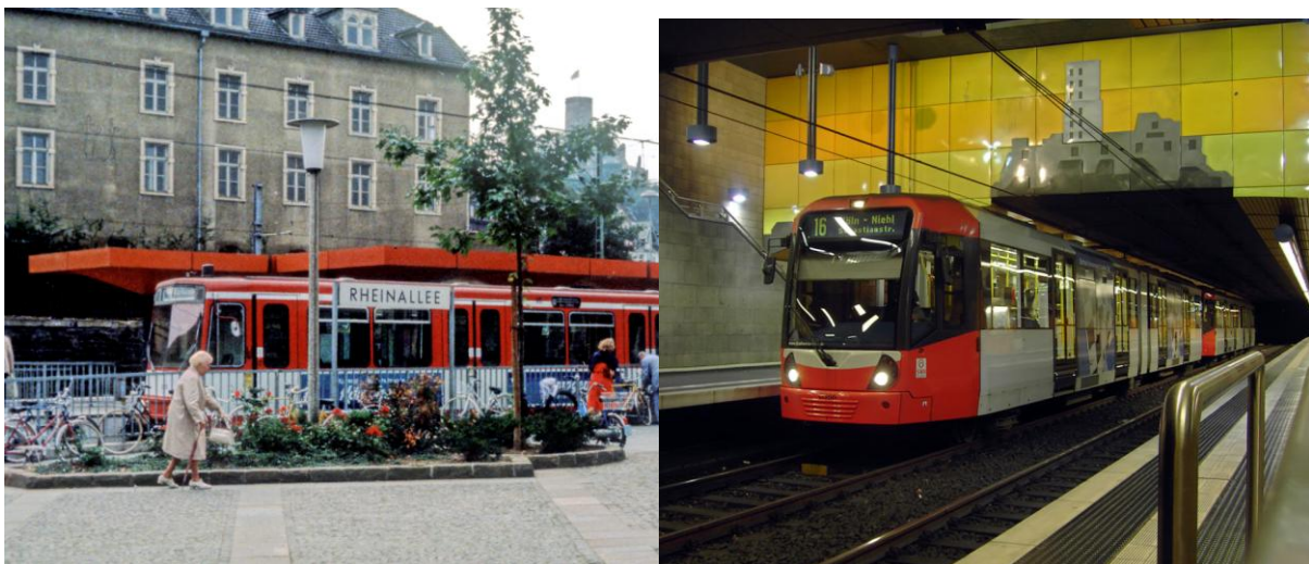
Figure 2: Past (surface) and present (underground) Bonn Bad Godesburg semi-metro stations