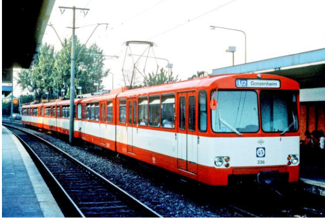
Figure 1: DüWag U2 car, surface alignment, Frankfurt

occurred earlier in the city's history, was to use transit for commuter traffic to clear the streets and highways for trucking and business rather than as an end in itself, and associated plans to clear the streets of trams.