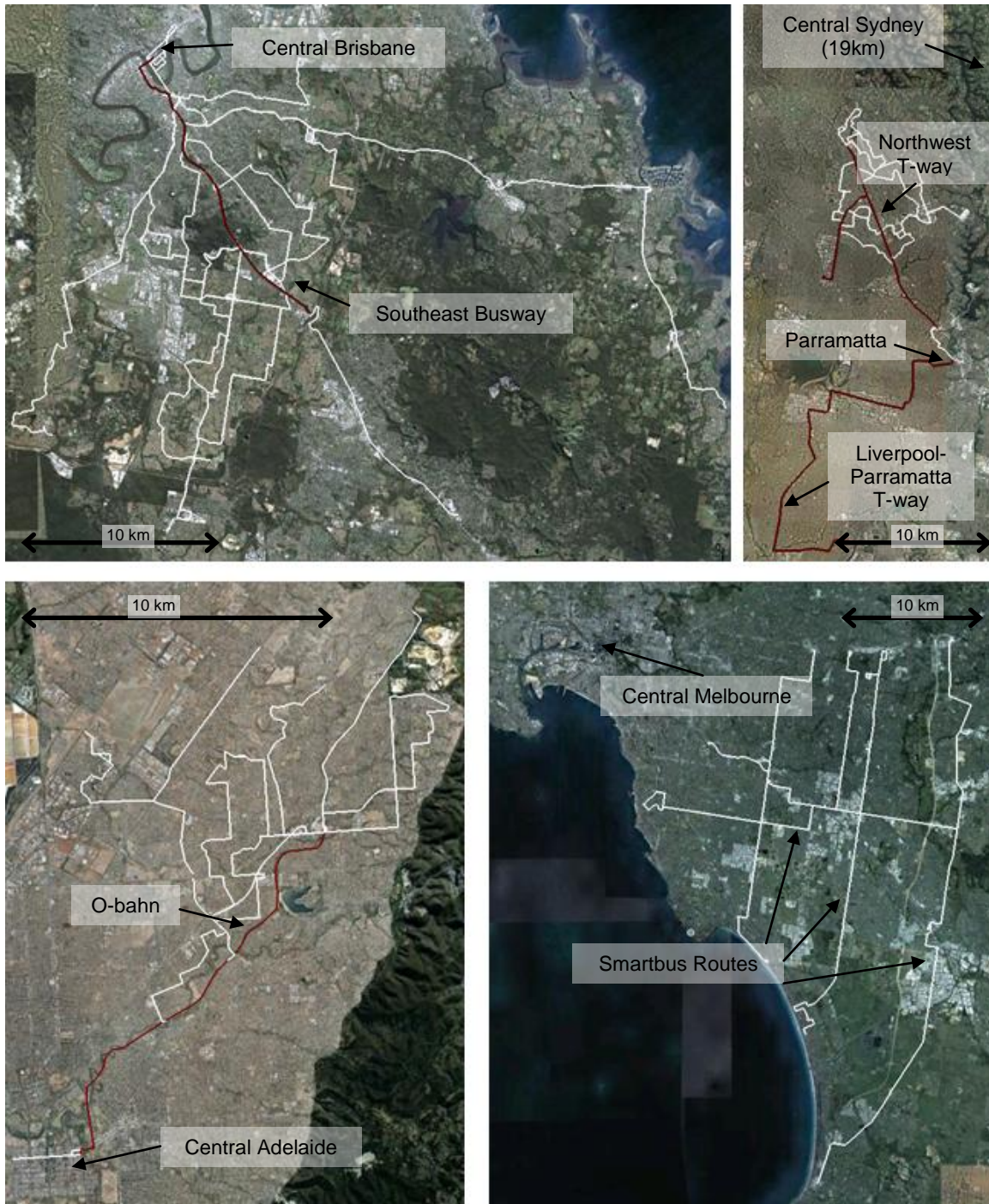
Figure 1: Maps of BRT systems in Brisbane, Sydney, Adelaide and Melbourne

Note: Dark red lines represent busways whereas white lines represent on-street running. Melbourne map only shows Smartbus routes for ease of interpretation