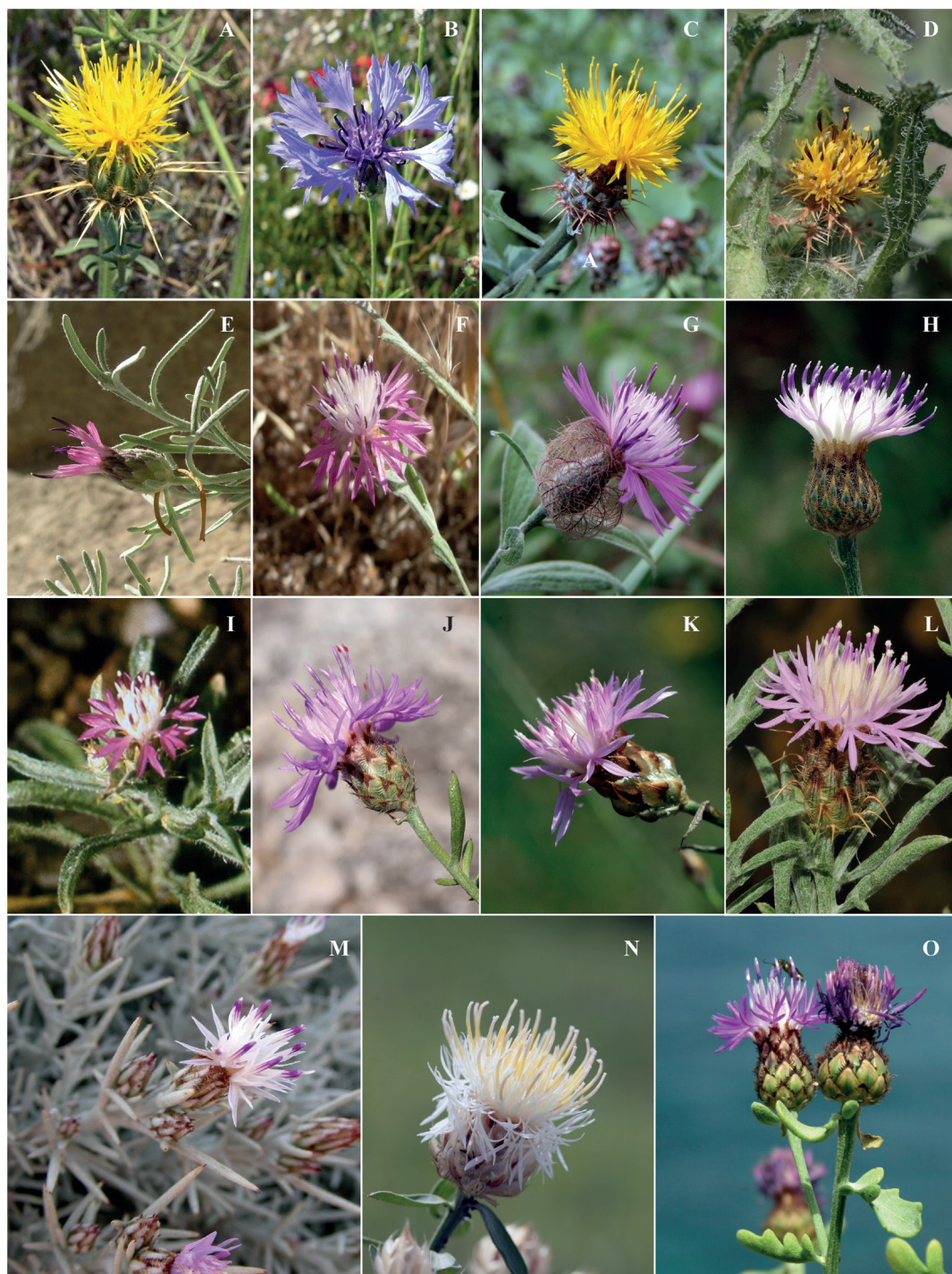
Figure 1. Photographs of the genus Centaurea , with special emphasis on subgenus Centaurea and sect. Centaurea . (A), Subgen. Lopholoma : C. ornata , Soria, Spain (Photograph: A. Susanna); (B), Subgen. Cyanus : Centaurea cyanus , Soria, Spain (Photograph: A. Susanna). (C) Subgen. Centaurea : East-Mediterranean Clade (EMC): (C), C. lycopifolia , Barcelona Botanical Garden (Photograph: A. Susanna). (D–N), Circum-Mediterranean Clade (CMC). (D), C. benedicta , Barcelona Botanical Garden (Photograph: A. Susanna); (E), C. akamantis , Avakas gorge, Cyprus (Photograph: M. Galbany); (F), C. hierapolitana , Afon lake, Turkey (Photograph: A. Susanna); (G), C. hyrcanica ( Jacea-Phrygia group), Iran (Photograph: A. Pirani); (H), C. exarata , Barcelona Botanical Garden (Photograph: A. Susanna); (I), C. patula , Barcelona Botanical Garden (Photograph: A. Susanna). (J–N), Sect. Centaurea . (J), C. tenorei , Minori, Italy (Photograph: A. Hilpold); (K), C. alba , Sierra de Aracena, Spain (Photograph: L. Barres); (L), C. pulvinata , Sierra de Abrucena, Spain (Photograph: G. Blanca); (M), C. horrida , Sardinia (Photograph: S. Pisanu); (N), C. princeps , Barcelona Botanical Garden (Photograph: A. Susanna); (O), C. panormitana , Sferracavallo, Sicily (Photograph: A. Hilpold).