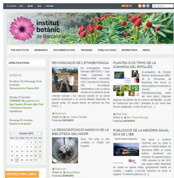
Figure 1. Homepage of the new website ( http://www.ibb.bcn-csic.es/ ) with the top tabs, the left frame with events and activities, the calendar and the list of interesting links and the central frame with the news section.

This news section is updated biweekly and includes pieces on mainly three subjects: (1) research, (2) documentation, and (3) activities (available only in Catalan and Spanish). The research news covers the main findings/results of the IBB researchers, but also includes the release of IBB-sponsored scientific publications and the activity of the IBB researchers (such as the publication of a new volume of Collectanea Botanica , a thesis defense, or the attendance of a scientific meeting). Regarding the