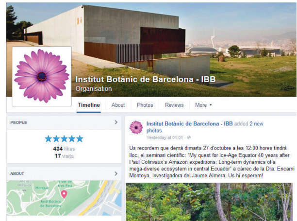
Figure 3. Facebook page ( http://www.facebook.com/InstitutBotanicBarcelona ).