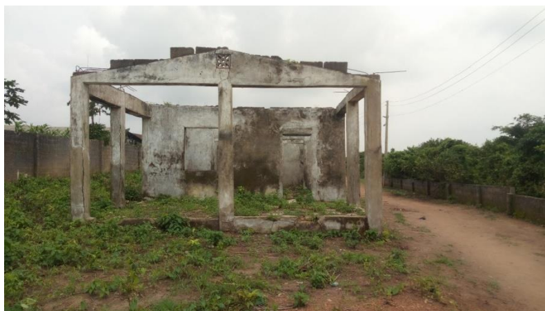
Figure 3: Picture showing Abandoned uncompleted building proposed for Primary Health Center at Oko-Ito Gberigbe