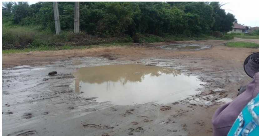
Figure 2: Rugged untarred road from Oko-Ito Community to Igbalu Community

89.3% and with a traveling time of about 15minutes on bike through a rugged road as shown in Figure 2. Further enquiry revealed that Igbalu Health Center only provides Out-Patients service as complicated cases are been referred to Imota Health Center for further treatment which is 20minutes drive from there. The current state of building assumed to be the proposed structure for Health center in Oko-Iko as shown in Figure 3 is devastating. Patronage of this healthcare can be influenced by its ownership i.e government, as people believe it is the duty of government to provide social services to it's citizens. Alternative health facilities that people of the study area resort to are patent medicine stores for count drugs and the usage of local herbs for treating ailments. Those that have received treatment at this center account for 65.3% of the respondents, of which 60.0% opined that the services received, was satisfactory. Also 51.3% of them did not pay for the treatment received while those that paid reported the price as pocket friendly. More so, 66.9% affirmed that they will be willing to pay for treatment if situation warrants it. Majority of the respondents (89.3%) opined that the provision of healthcare should be done by the government, which is considered as part of dividends of democracy and; 66.1% of them said that it is the sole duty of the state government which is the second tier of government to be the major provider of these facilities.