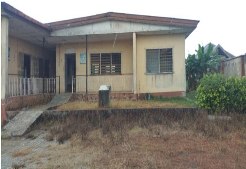
Figure 4: Untidy environment at Igbalu Primary Health Center, in Ikorodu Local Government of Lagos state.