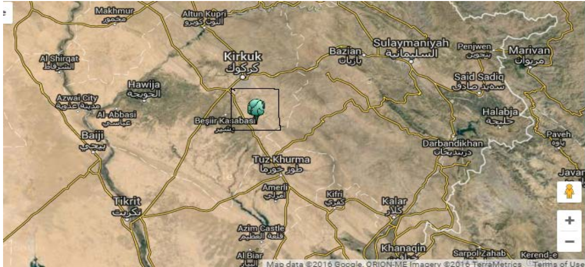
Figure1: Map of Study Area