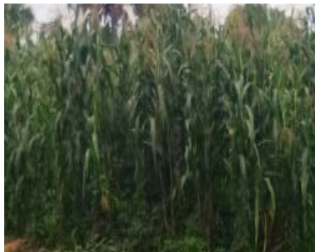
Figure 2: Field received vinasse