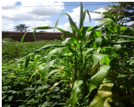
Figure 3: Field without vinasse