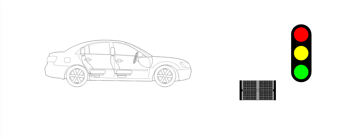
Figure 1: General structure of the proposed system

The operation of the traffic light control logic is conceptually different from that of any other of the traffic light control system implemented by the traffic as it is based on the acquisition of the sequence of positions and velocities obtained from satellite positioning receivers of only instrumented vehicles. It must be noted that the control system only considers the presence of "instrumented" vehicles in the logic for the assignment of green at the traffic-light phases.