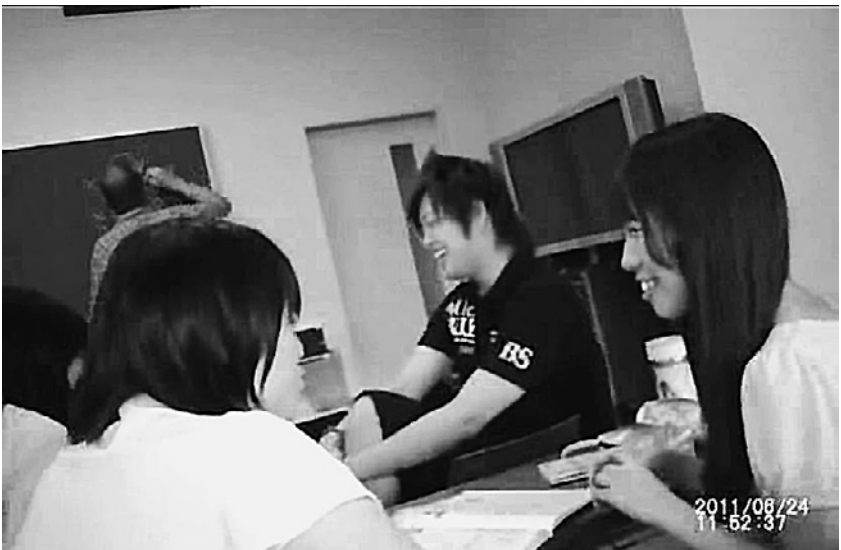
Screenshot 1: From the i-Kam Xtreme video glasses