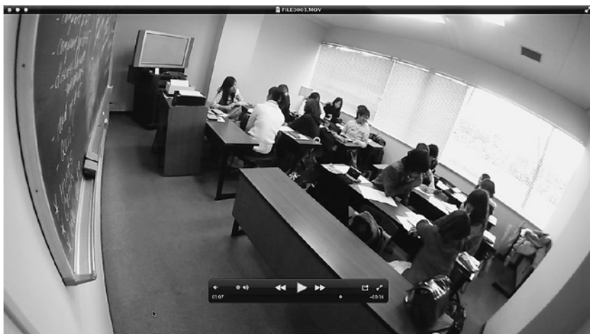
Screenshot 6: From the teacher wearing the Drift HD camcorder

Again, the Drift HD captures excellent POV footage, but being a side-mount unit, it will be challenged by the GoPro Hero 2, which also accepts an external microphone and has the advantage of being centrally mounted. The Drift HD effectively captures verbal and nonverbal interaction, even in the noise of a typical language classroom. Drift, like Looxcie, is also exploring the potential of live streaming.