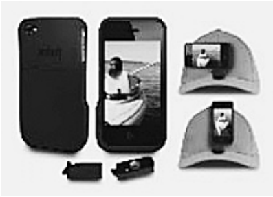
Figure 3: Apple iPod Touch with HatCam