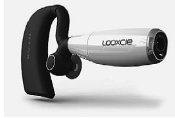
Figure 2: Looxcie LX1