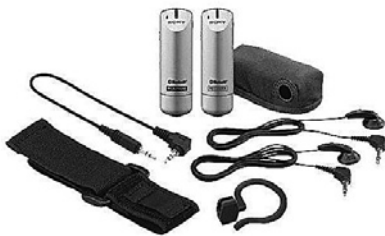
Figure 7: Sony ECM-AW3 wireless microphone

Having experimented with POV camcorders since September 2010, a number of clips made from footage captured in oral communication classes have been