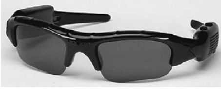
Figure 1: i-Kam Xtreme