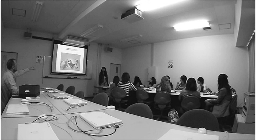
Screenshot 4: A view of a seminar class from the Contour+ on a tripod

Though not able to record consistently clear audio, both wireless systems adequately captured both the voice of the wearer and partner (Screenshot 5). They were both useful for capturing footage from which 2 to 3 minute clips were edited and subsequently used as classroom materials. In this case in particular, the clips were used to provide near-peer role modeling of conversation strategies.