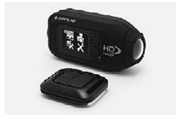
Figure 6: Drift HD

A participant perspective, in comparison, involves not only what a participant sees, but includes a “subjective evaluation” (“perspective,” n.d.). A truly participant perspective, however, is impossible to achieve, even with a POV camera. POV recordings, when combined with participants’ subsequent guided reflection (Land & Zembal-Saul, 2003), can only provide a closer approximation.