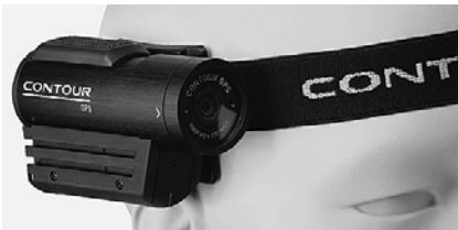
Figure 5: Contour+