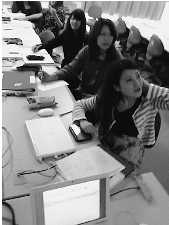
Screenshot 2: From an iPod Touch mounted on a HatCam

Used in trials to capture student presentations in a seminar class, the iPod Touch with HatCam was effective in giving students a general impression of what the wearer sees (Screenshot 2). During one presentation, the presenter wore the HatCam. In another presentation, a student watching the presentation wore the HatCam, giving a perspective from the audience (Picture 2). Both