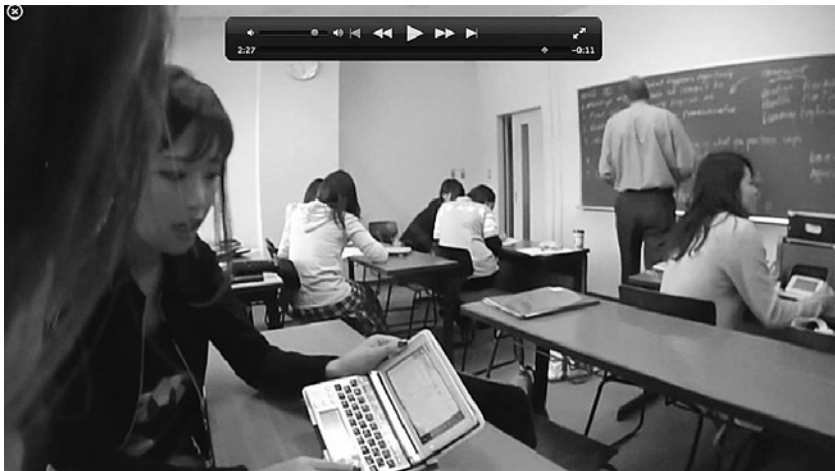
Screenshot 5: From the Contour+

The Drift HD is another excellent, HD quality POV camcorder. It is the second generation of the Drift product, being the smallest currently on the market (December, 2011). It has a wide, 170° view and a convenient viewfinder, which