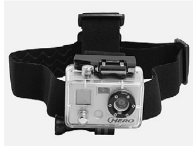
Figure 4: GoPro Hero