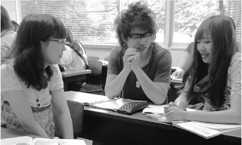
Picture 1: An oral communication student wearing the i-Kam Xtreme video glasses