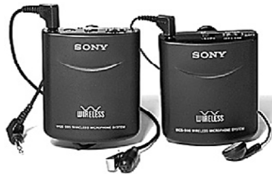
Figure 8: Sony WCS-999 wireless microphone