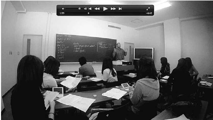
Screenshot 3: Capturing teacher instruction with the GoPro Hero HD

a particular student's experience for the whole period and to make it easier to keep track of who had worn the camera. This was made possible by the relatively long life of the GoPro lithium battery.