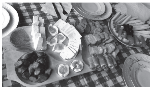
Fig. 9: Locally produced traditional food offered by the guesthouse (Photo by the authors, 2014.9.4)

http://www.discovertamavamare.org/staying/bed-breakfast/pension-cartref/ )