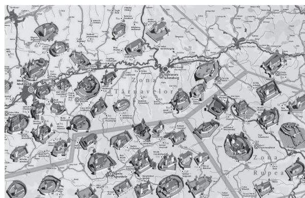
Fig. 4: Saxon architectural heritage in Southern Transylvania: fortified churches