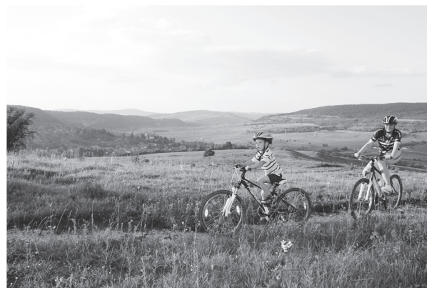
Fig. 6: Tourism infrastructure: cycling trails