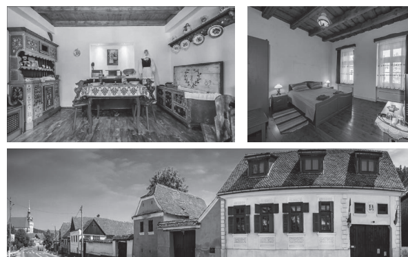
Fig. 8: Guesthouse in Saschiz in a refurbished traditional Saxon house (Source:

This remains a major challenge, so that ADEPT Foundation, local authorities and the Tourism Association are exploring means to attract more visitors and encourage them to spend more time (and money) in the region. Diversification of the tourism offer, as well as improved branding and marketing of the destination both nationally and abroad are some of the solutions suggested.