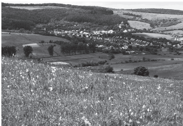
Fig. 2: Traditional rural landscape in Southern Transylvania

In this context, diversification of economic activities in non-farming sectors, especially rural tourism, capitalizing on local tourism resources, has been promoted for its potential