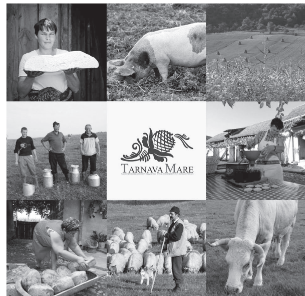
Fig. 10: Traditional local food products and branding

ADEPT's community education efforts have helped raise awareness regarding local heritage and the need for preservation of traditional rural landscapes, Saxon