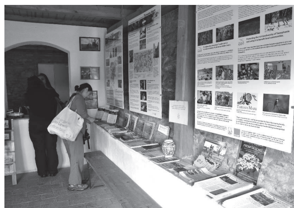
Fig. 5: Tourist Information Center in Saschiz

The NGO's strategy has proved successful to some extent, and the result over the years has been a gradual increase in the number of local businesses offering various tourism services (guesthouses, restaurants, tours etc) (see Fig. 8, 9).