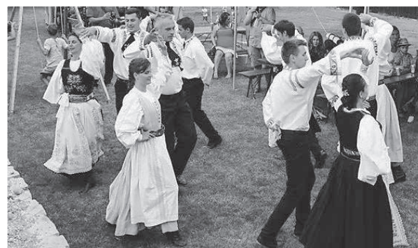
Fig. 7: Saxon Traditional culture festival