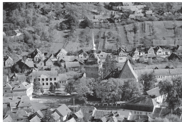
Fig. 3: Typical Saxon village in Southern Transylvania: Saschiz (UNESCO heritage site since 1999)

In spite of such potential, implementation of rural tourism has proved difficult, due to various local limitations. One of the main obstacles is the lack of skilled workforce, which remains one of the major complaints of local entrepreneurs.