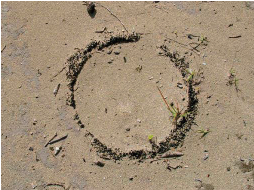
Fig. 7. A disappearing coconut palm – a strange evocation of the Japanese flag?

Historically and culturally, Japan has a strong influence in the Pacific Region. It will be a great opportunity for Japanese research to invest more for conservation of biodiversity in the Pacific Islands, and more specifically for conservation of the coconut palm. Indeed, coconut remains one of the crops most neglected by scientists, in regards of its economic value and cultural importance. Despite the enormous potential of the crop, coconut farmers often scrap a living below the poverty line. About 96% of the farmers, who collectively grow coconuts on 12 million hectares worldwide, are smallholders tending less than four hectares (Frison, 2006). Coconut farmers were marginalized. Many do not own the land they work, lack the resources to invest in technologies that would improve production, and are considered non-bankable by the formal banking sector. Many traditional varieties of coconut palms are presently disappearing and there is a huge and urgent need to safeguard the remaining. From this point of view, projects based on the Polymotu concept could be implemented in collaboration between Japan and the few International and French institutions that are already involved in this research field.