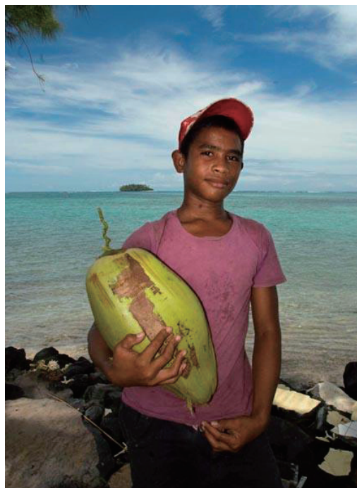
Fig. 6. A Samoan teenager, with the huge niu afa coconut fruit and the Nusafee Island in the background.