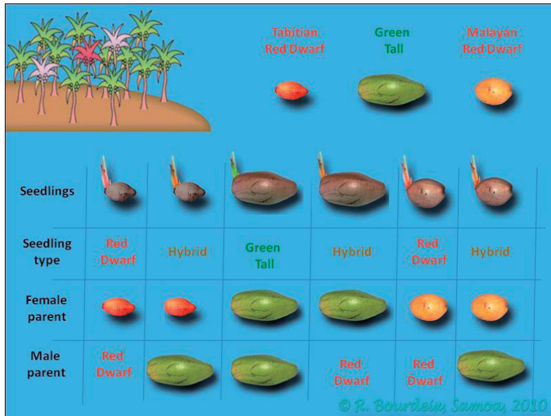
Fig. 5. Plantation of 3 coconut cultivars in the same island for harvesting seedlings of both the 3 varieties and coconut hybrids (distinction made on the colour of the sprout).

heritage varieties, Samoan farmers and small producers of virgin coconut oil could increase their incomes and improve their livelihoods.