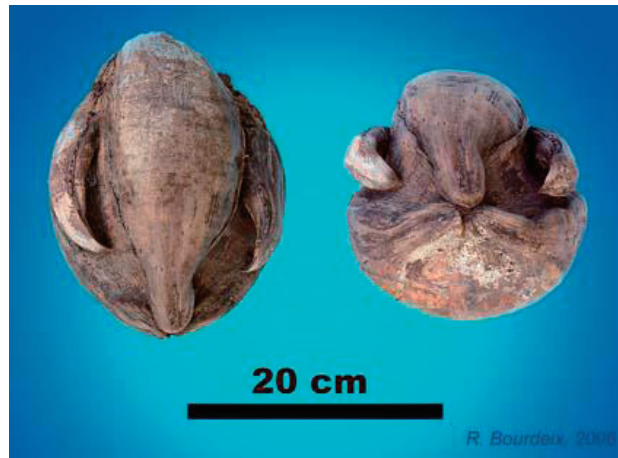
Fig. 3. A rare form of horned coconut found and being replanted on Tetiaroa Atoll.

In 2010, we began to replant one of islands of the Tetiaroa atoll with a very rare form of horned coconut, as shown in Figure 3.