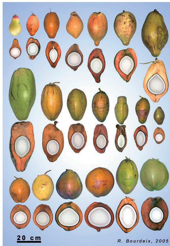
Fig. 1. Genetic diversity of the fruits of various coconut varieties (Bourdeix et al. 2005). From left to right, then top to bottom: First rank: Papua Yellow Dwarf (PNG), Tahiti Red dwarf (French Polynesia), Madang Brown Dwarf (PNG), Cameroon Red Dwarf (Cameroon), Spicata Tall Samoa (Samoa), Rotuman Tall (Fiji), Rennell Tall (Solomon Islands); Second rank: niu afa Tall (Samoa), Comoro Moheli Tall (Comoro Islands), Sri Lanka Tall Ambakelle (Sri Lanka), West African Tall Akabo (Côte d'Ivoire), Tuvalu Tall Fuafatu (Tuvalu Island), West African Tall Mensah (Côte d'Ivoire), Micro Laccadives Tall (India); Third rank: Vanuatu Tall (Vanuatu), Malayan Yellow Dwarf (Malaysia), Malayan Tall (Malaysia), Tagnanan Tall (Philippines), Tampakan Tall (Philippines), Kappadam Tall (India).

Melanesians. Except the small island of Bellona, also populated with Polynesians, the distance from Rennell to the nearest island is 170 km.